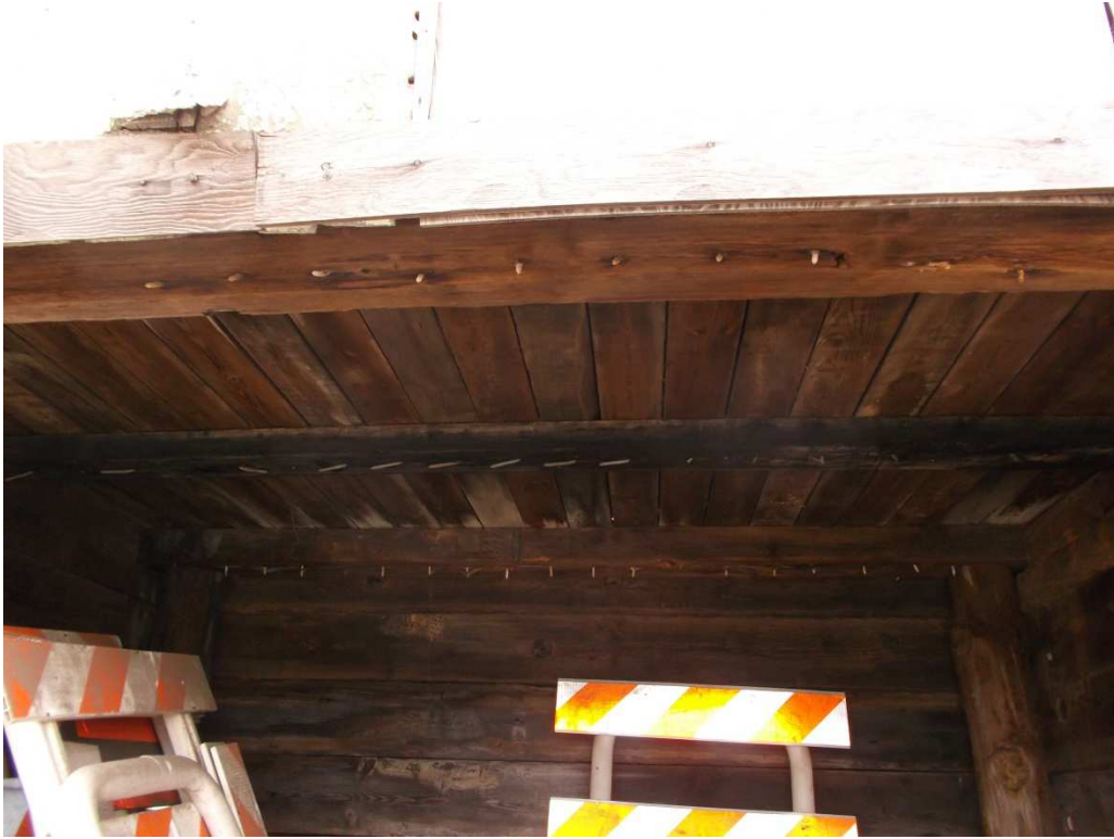
Equipment Storage Building