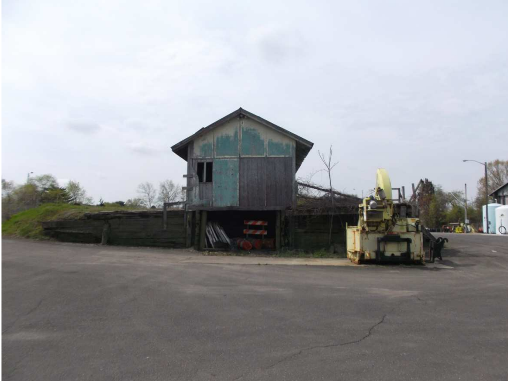
Equipment Storage Building