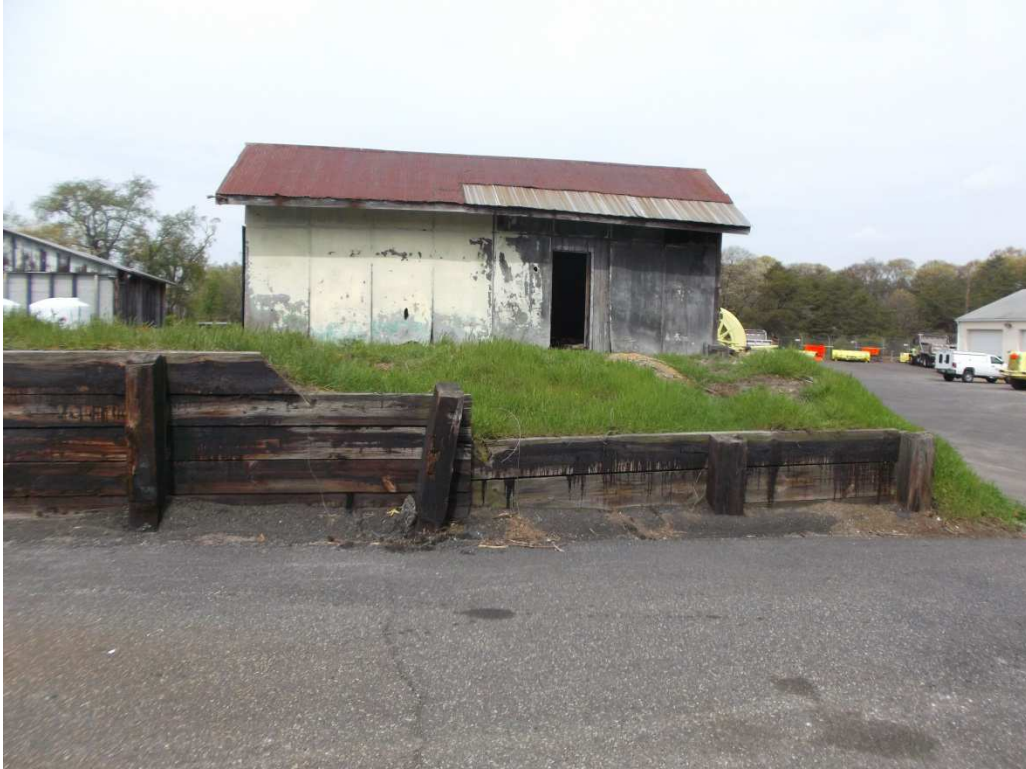
Equipment Storage Building