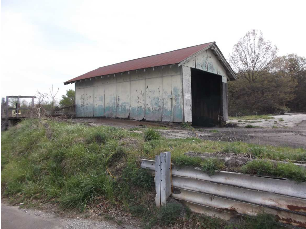
Equipment Storage Building