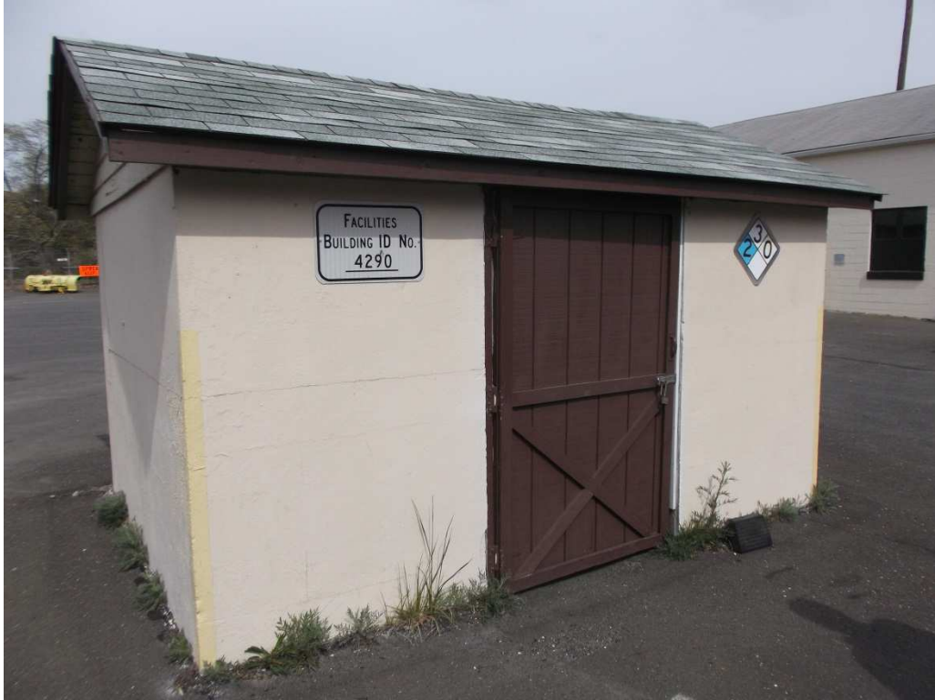
Volatile Storage Building