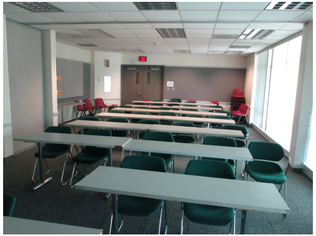
View of existing conference room on first floor.