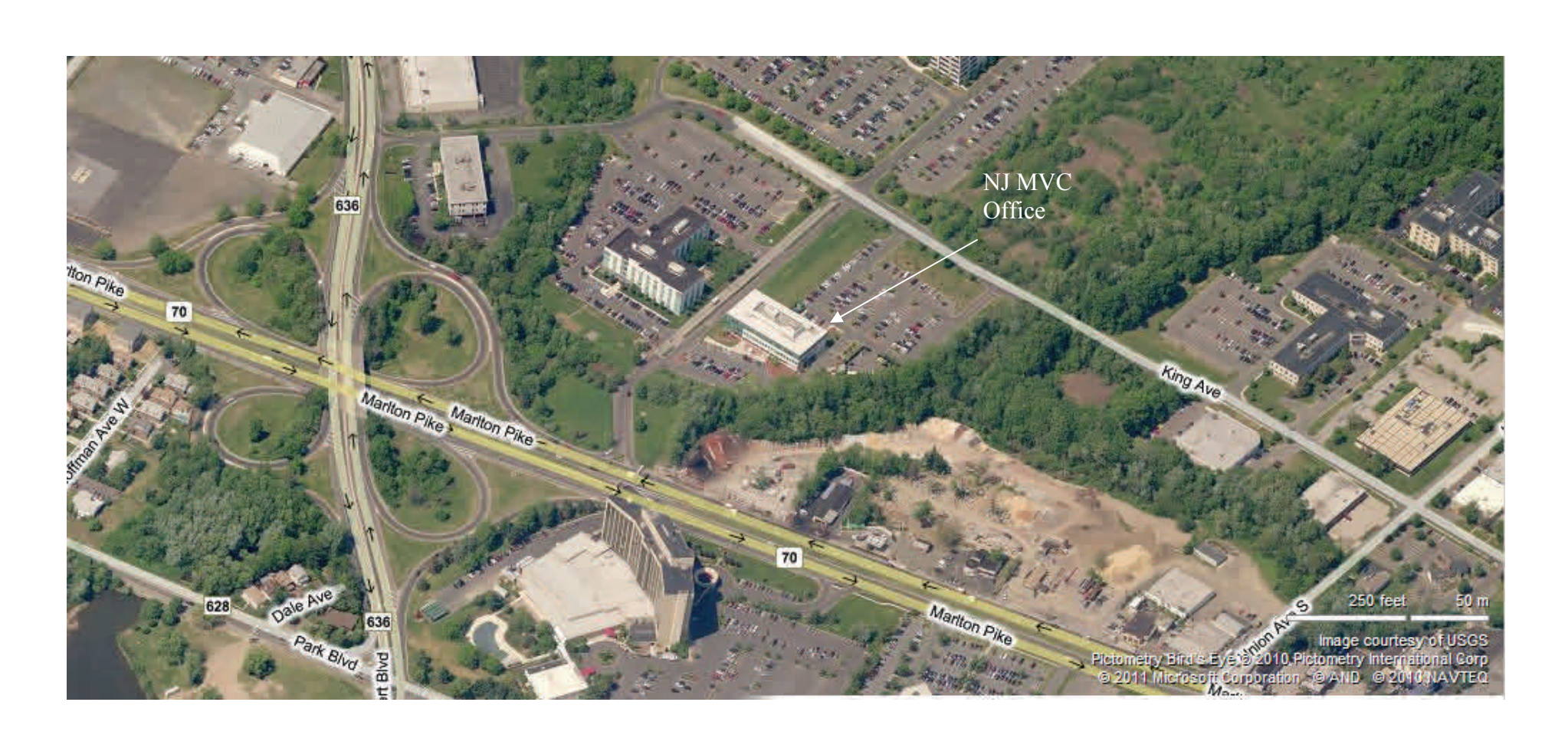
NJ Motor Vehicle Commission Office Location Map EXHIBIT 'B'