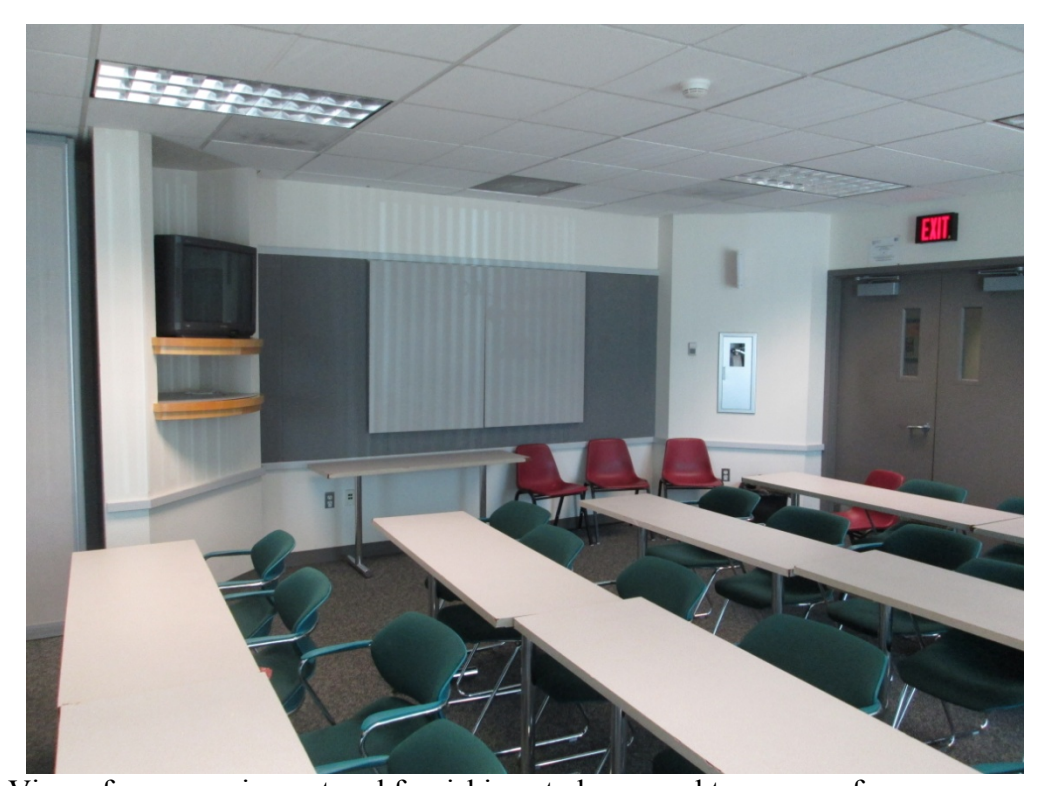
View of some equipment and furnishings to be moved to new conference room.