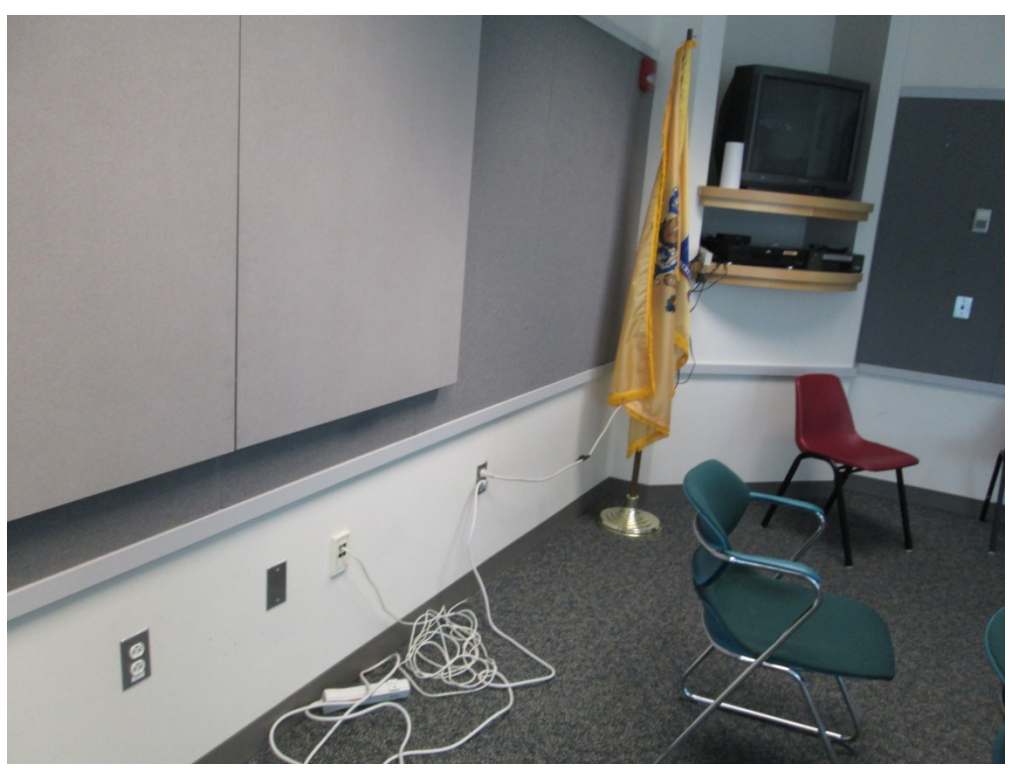
View of some more equipment and furnishings to be moved to new conference room.