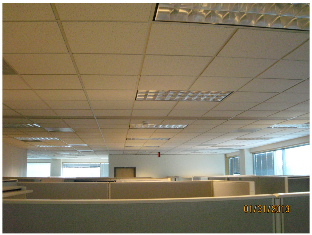
View of third floor new conference room area looking toward Right-of-Way office. Note smoke detector and fire exit sign in ceiling.