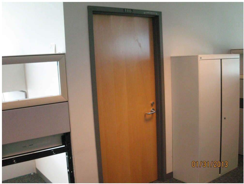
Door to Right-of-Way office to be relocated.