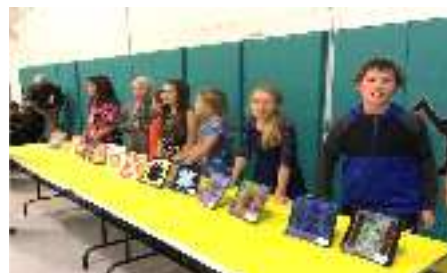
Students demonstrate their projects.. Shown: Robotics and Quilting Sections