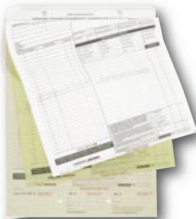
Multiple Copy Forms

Depend on Midwest for all your data processing supply needs, custom forms, mailers, form label combinations, checks and continuous labels, unit sets, cut sheets and envelopes.