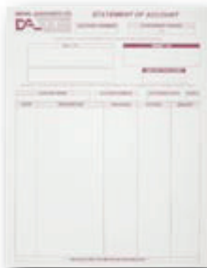
Cut Sheet Invoice Forms

Effective everyday office forms are integral to your business success.