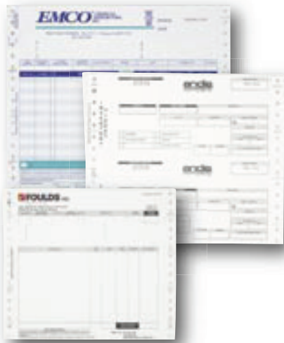
Continuous Invoice Forms