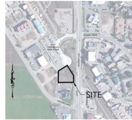
VICINITY MAP SCALE: 1"=200'

BID DOCUMENTS RFTA CONTRACT #15-009 CDOT PROJECT #20828 SH #133