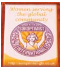
Fridge Magnet with SIGBI logo and website address. Was £1.20 now £1.02