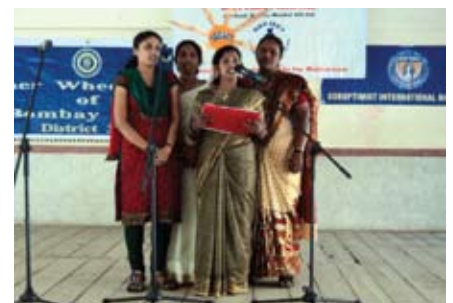
SI Bombay North brought together 500 underprivileged women for IWD.