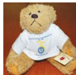
Teddy Bear 26cm jointed bear, with 75th logo and website. Was £7.50 now £3.07