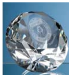
Diamond shaped paperweight with 75th logo & certificate in presentation box. Was £28.00 now £12.00