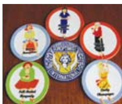
6 Fun Coasters (1 logo design and 5 designs as fun notelet. Were £5.50 now £5.10