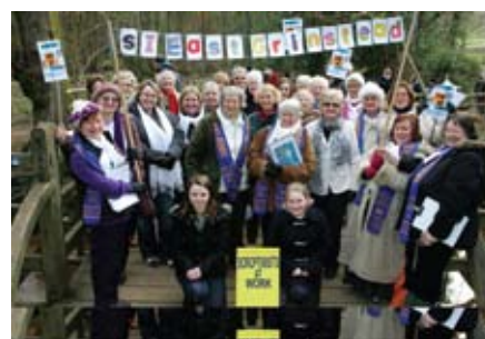
SI East Grinstead celebrated on one of the UK's most famous bridges: Pooh Bridge!