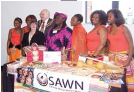
SI Oldham showcased organisations that focus on women's issues.

SI NORTHWICH held its 'Join us on the Bridge' event at HMP Foston Hall as the culmination of their Club project there. It was a very happy occasion as the last formal visit coincided with the 100th anniversary of International Women's Day.