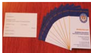
Membership Cards 10 cards per pack £1.22