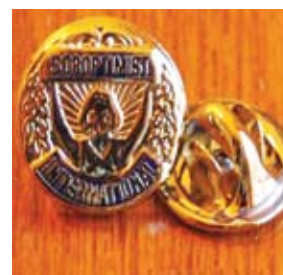
1/2" Badge available as clasp fitting or magnetic £3.26