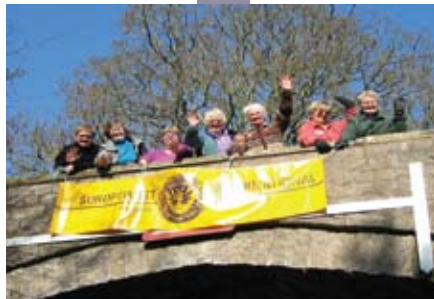
SI Penrith celebrated the commitment and determination of women!

SI PUNE METRO EAST report that while women across the world marked the day