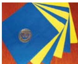
15 Blue Napkins or Yellow Napkins with gold emblem £2.04