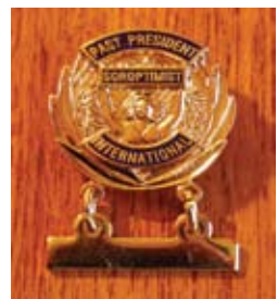
Past President Badge £5.98