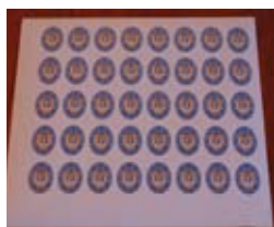
Stick on Emblems (40 stickers per sheet). £0.61