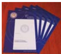
Membership Certificates 5 certificates per pack £2.56