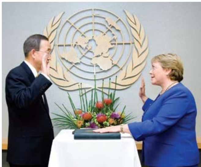
UN Secretary General Ban Ki-moon swears in Michelle Bachelet as Executive Director, UN Women