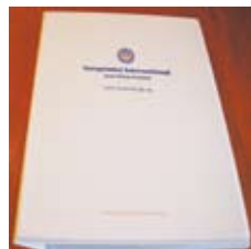
A4 Ringbinder White with Blue/Yellow logo Was £3.83, now £1.92