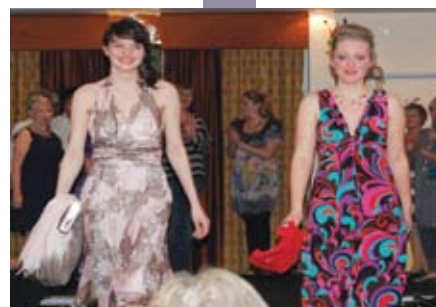
SI Bristol's fashion show combined fundraising, fun and celebration.

SI GARSTANG invited Soroptimists from Clubs around the Region, and representatives from other women's groups, to join them on a local bridge to build a 'bridge of peace'. It proved a very successful and colourful event as they were also joined by several local mayors and the Garstang Town Cryer. As the world's first Fairtrade town, the event was combined with an