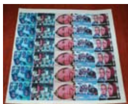
Promotional Stickers 30 per A4 sheet of 5 designs. Was £1.40 now £1.22