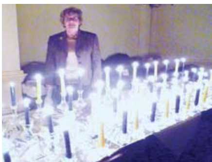
SI Staffordshire Moorlands' candlelit supper with a candle for every SIGBI Club.