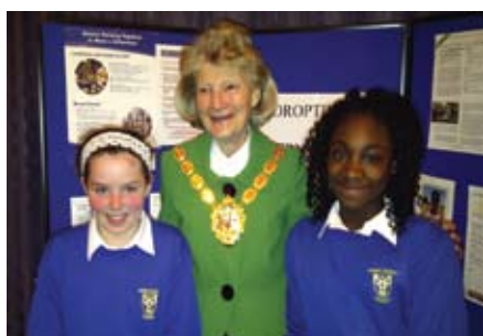
SI Croydon held the final of their 'Loud and Proud' public speaking competition.

SI MORPETH remembered Emily Wilding Davison, a suffragette, who made her final, tragic demonstration at the Epsom Derby on the 13th June 1913 when she ran out onto the racetrack and was struck down by the Kings horse. Emily is buried in Morpeth. SI Morpeth members attended the remembrance and memorial service.