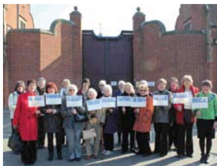
SI Northwich celebrated IWD at their project at HMP Foston Hall.