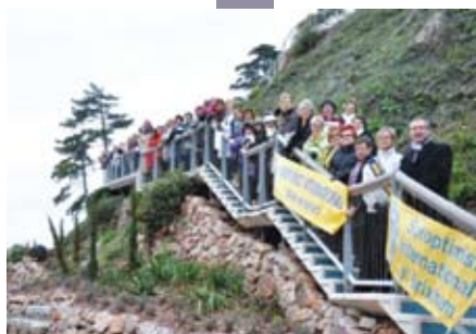
SI Brixham rallied in Torquay and then stepped out to promote IWD.

author spoke about her work with young women who had very harrowing tales. Donations raised £255 for the Barnardo's Turnaround Project.