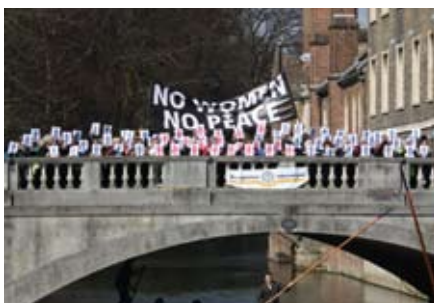
SI London Anglia brought 100 women together on the famous River Cam.