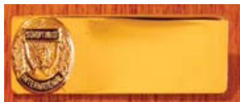
Name Bar £3.58