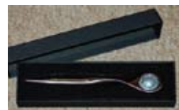
Engraved globe silver paper knife. Was £7.50 now £7.20