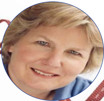
Sandi Toksvig, Keynote Speaker, Conference 2011

Sandi Toksvig is a writer and broadcaster with a distinguished career in TV, theatre and in the media. She is happy to speak at a wide variety of special occasions – in fact, making people happy is one of the things she does best. In 2007 she was voted Broadcaster of the Year by the Broadcast Press Guild and Channel 4's Political Humorist of the Year.