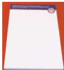
A4 Letterhead 250 sheets per pack. £12.25