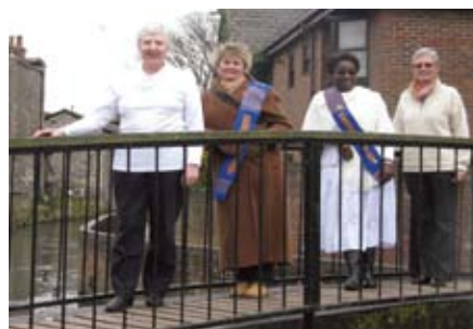
SI Canterbury met on a local bridge highlighting the challenges that women face.