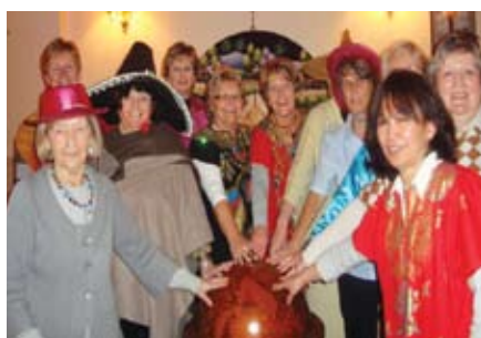
SI Crieff held an international evening for IWD and celebrating Fairtrade Fortnight.