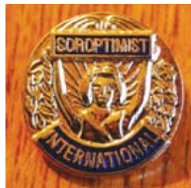
3/4" Badge available as a clasp fitting or magnetic £3.26