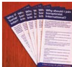
SIGBI leaflets "Why Should I Join?" Pack of 50: £3.00