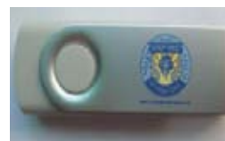
SI Logo Memory Stick (2gb) with website address. Was £7.05, now £5.88