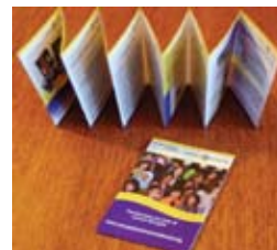
DPI/NGO Leaflets Price per leaflet £0.15