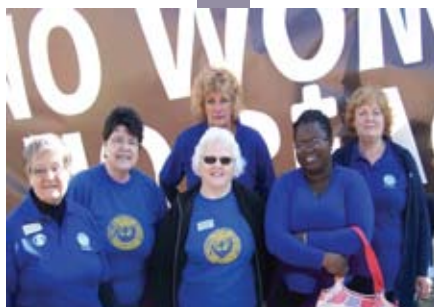
Members of SI Colchester on Silver Street Bridge.

SI COLCHESTER ran a number of events and finally celebrated with 100 Soroptimists and