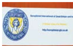
Car Sticker with SIGBI logo and web address. Was £1.25 now £1.02