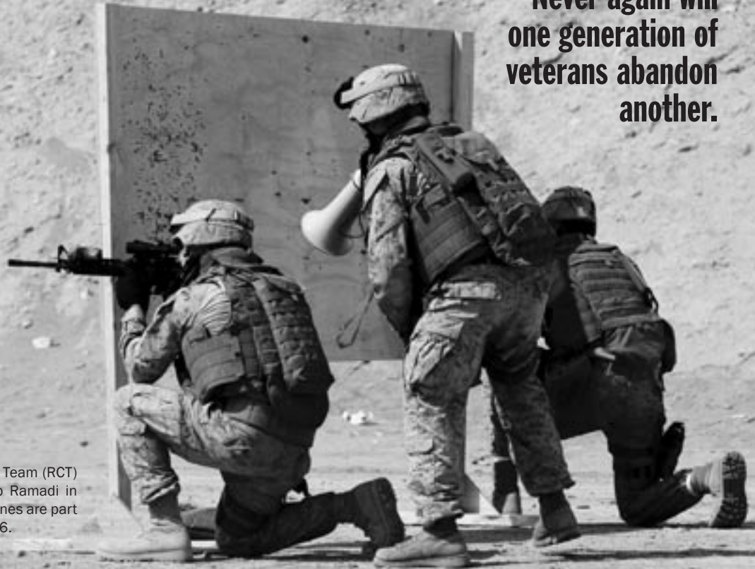
U.S. Marines with Regimental Combat Team (RCT) 6 conduct live-fire exercises at Camp Ramadi in Ramadi, Iraq, March 6, 2009. The Marines are part of the Personal Security Detail of RCT-6.

Never again will one generation of veterans abandon another.