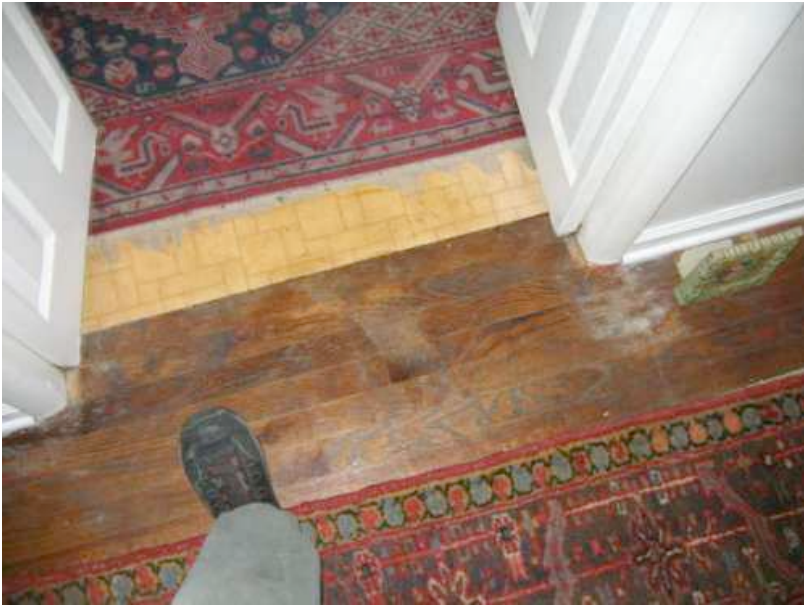
Sloping floor at the doorway between the living space and the kitchen.