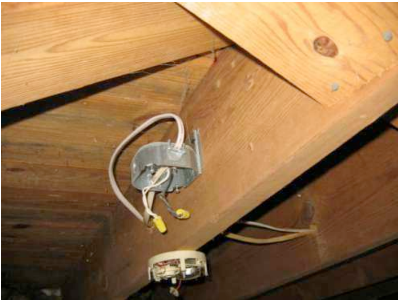
Unenclosed electrical junction box in the basement ceiling. Deficient.