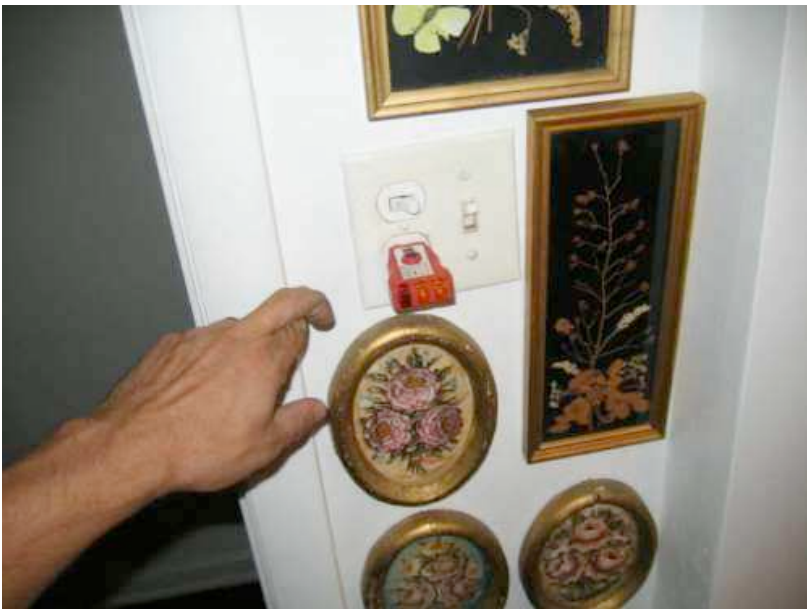
Missing GFCI protection in all of the bathrooms. Deficient.