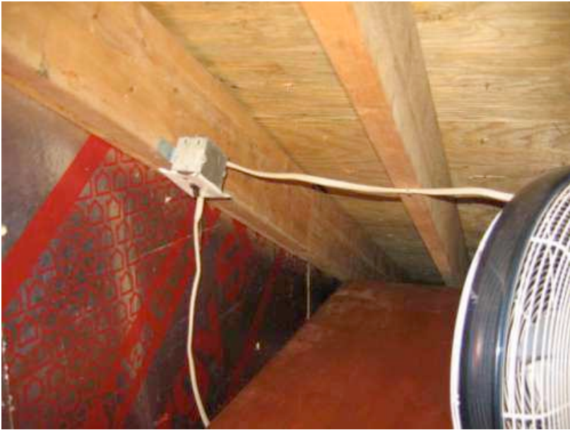
Improperly installed electrical components and wiring in the attic space. Deficient.