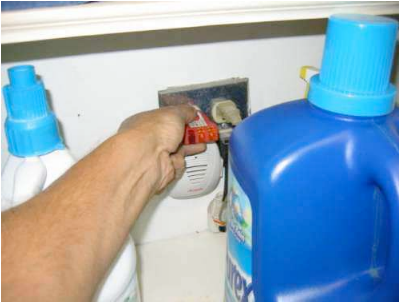
Missing GFCI protection at the laundry tub area. Deficient.