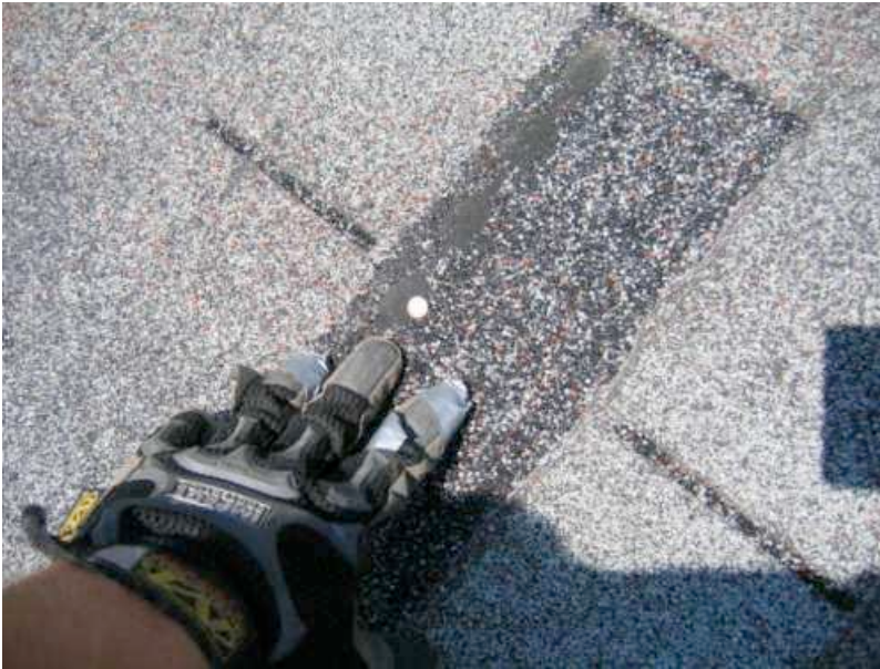
Missing shingle tab at the rear right corner of the roof. Exposed roofing nail. Prone to water penetration. Deficient.