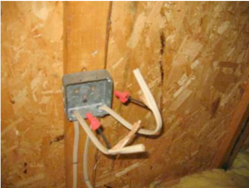
Open electrical junction box in the attic space. Deficient.