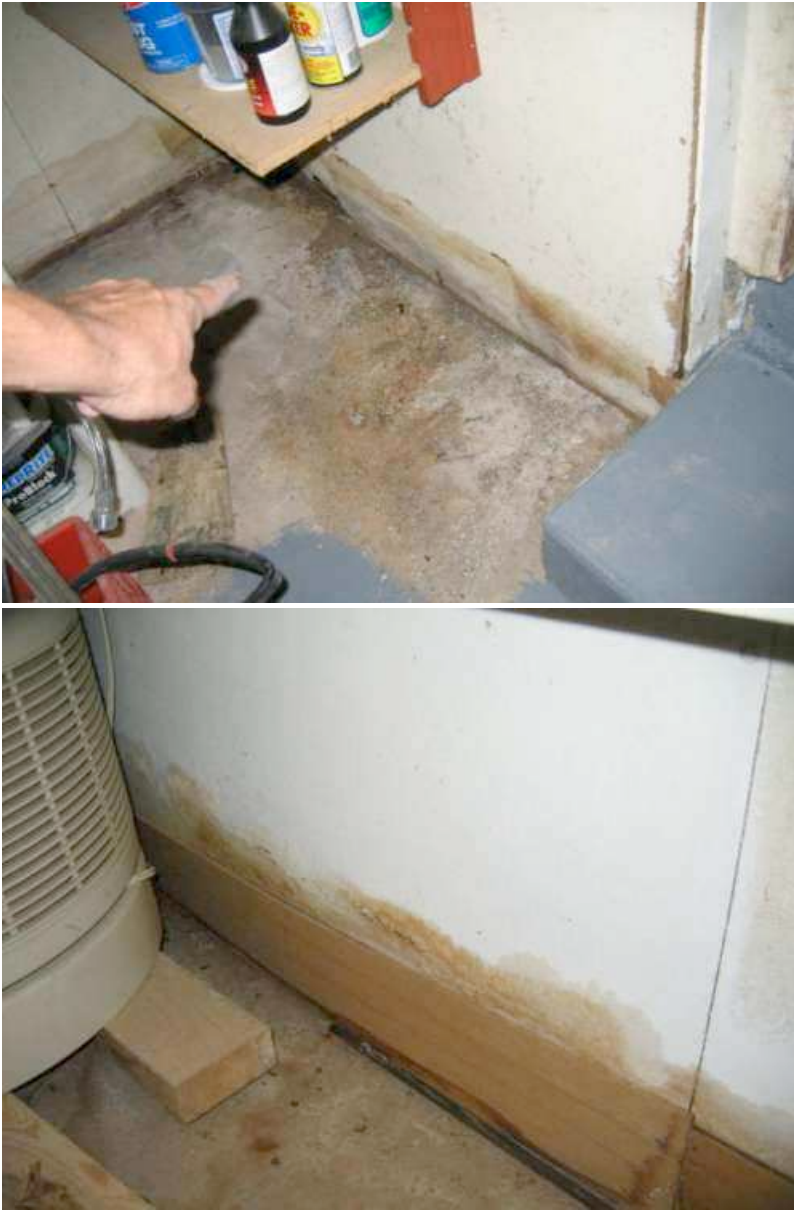
Evidence of water intrusion at the bottom of the finished walls in the basement. Deteriorated wooden materials and components at those basement walls. Deficient.