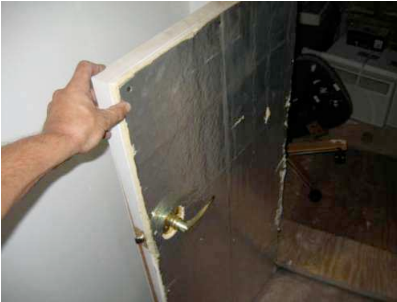
The access door to the attic space is inadequately insulated and not sealed properly. Deficient.