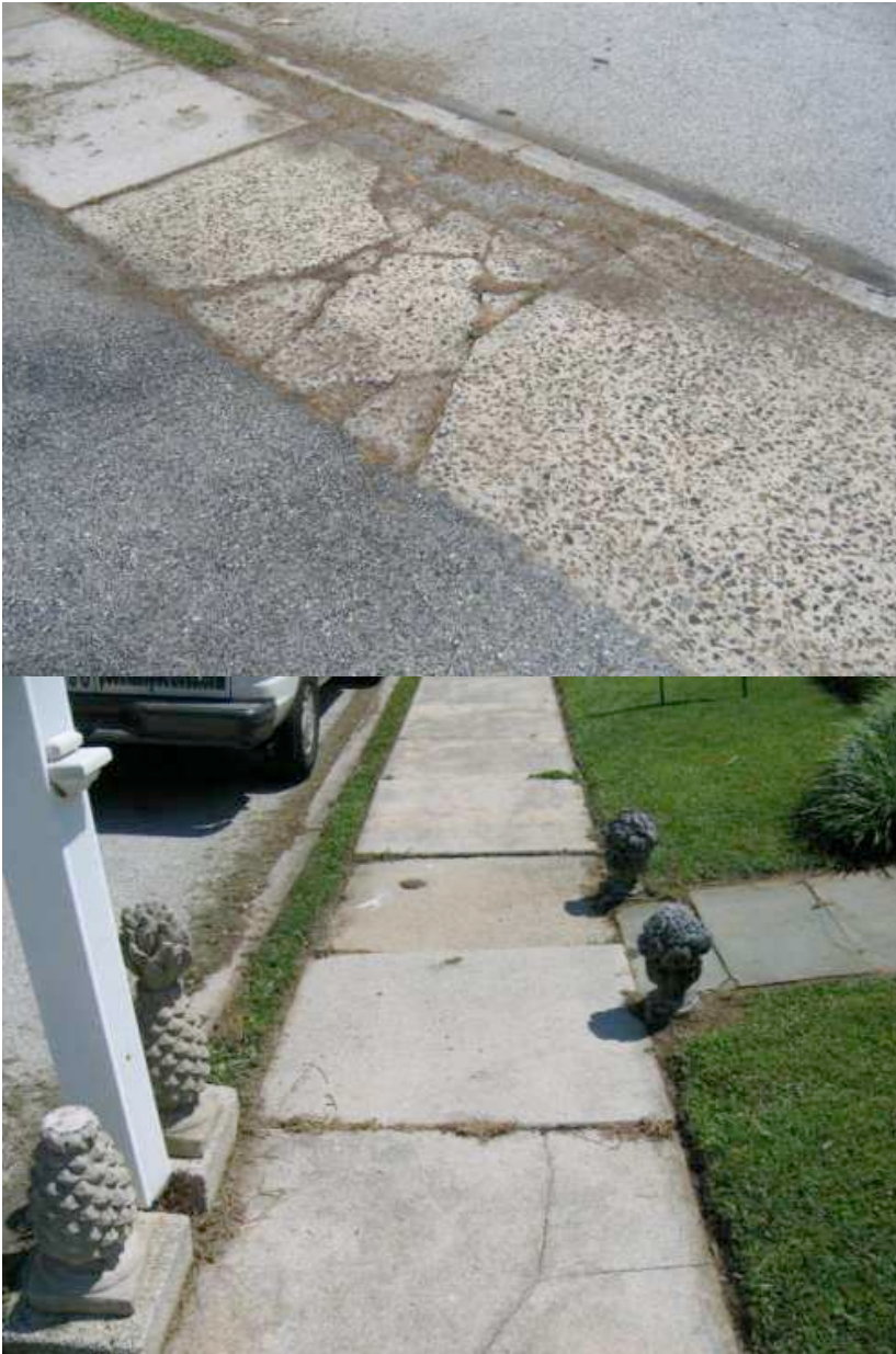
Differential movement, cracking, and uneven surfaces at the walkways.