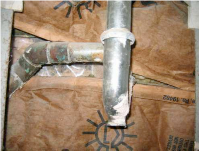
The chrome-coated soft brass drain fitting under the laundry tub is showing evidence of leaking. Deficient.