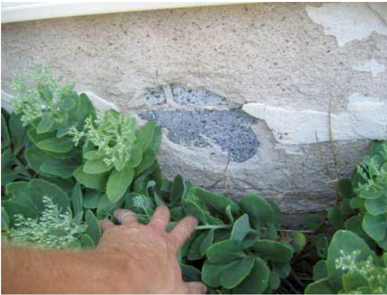
Cracking of the concrete exterior surface, located at the top of the foundation wall.