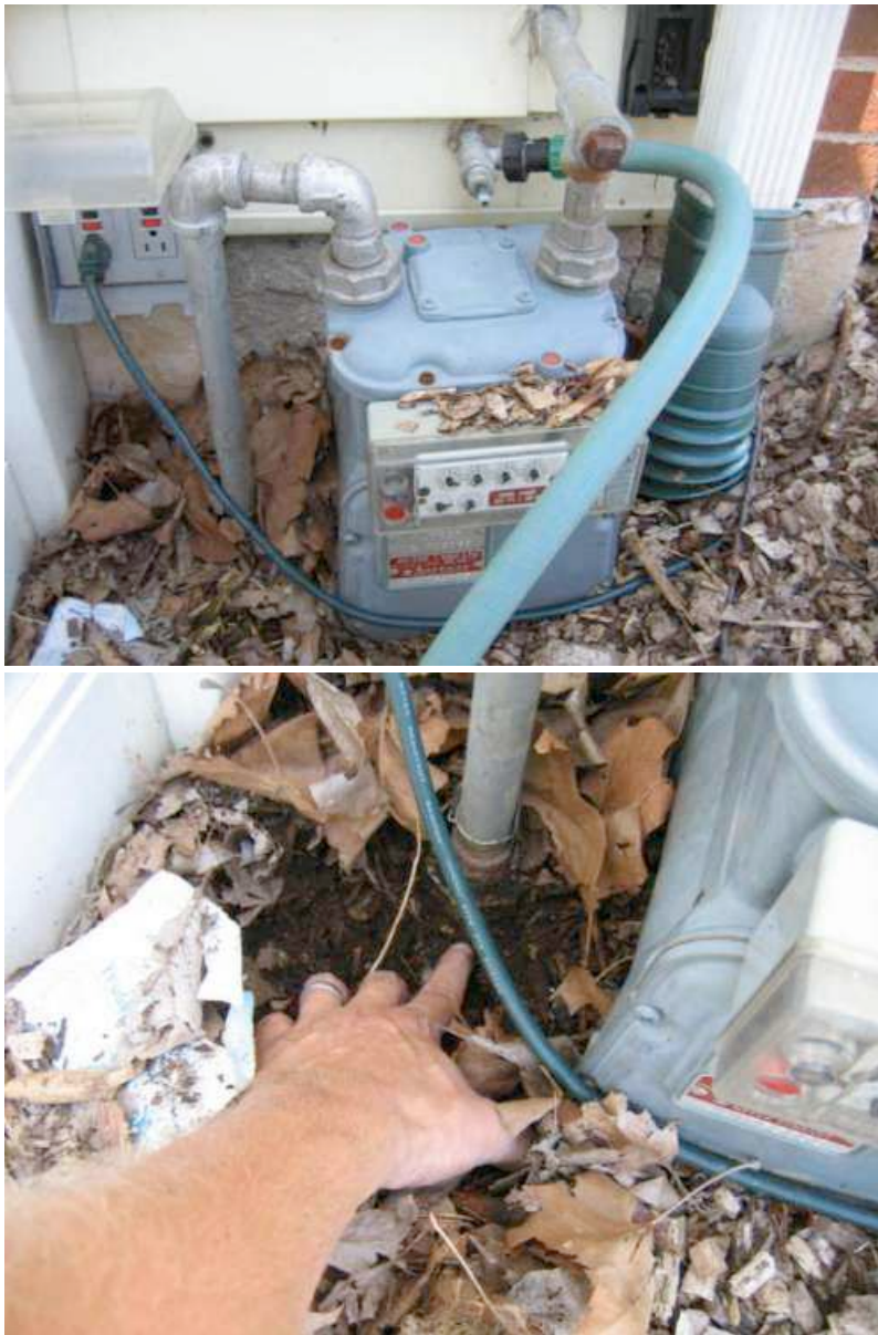
The main shut-off valve at the gas meter is buried under dirt. Deficient.