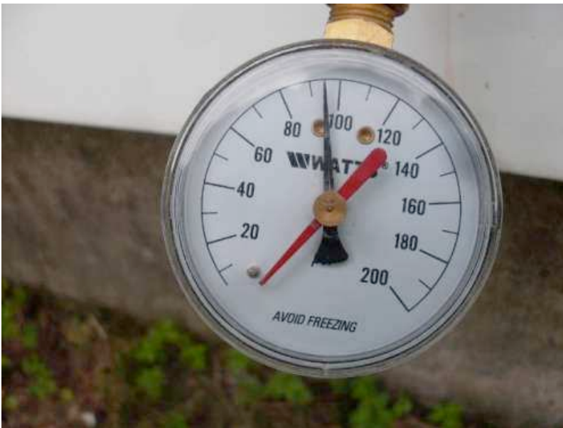
Pressure was over 80 psi, and it is considered Deficient. A pressure reducing valve (or regulator) was not found. Recommend having a plumber determine if pressure regulator is present and adjust pressure as needed. Note: No comment on pressure reducing valve is required unless the pressure is over 80. If pressure is over 80, it is automatically Deficient, and, therefore, defer inspection for the regulator to the plumber. Comment John Cahill.