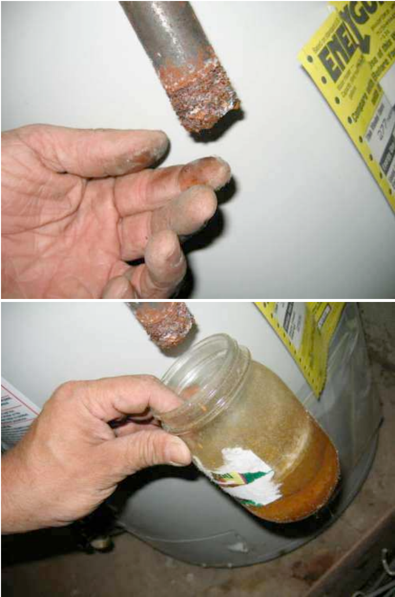
There is a small glass jar positioned below the TPR valve of the hot water tank. The valve is actively leaking water. Deficient.