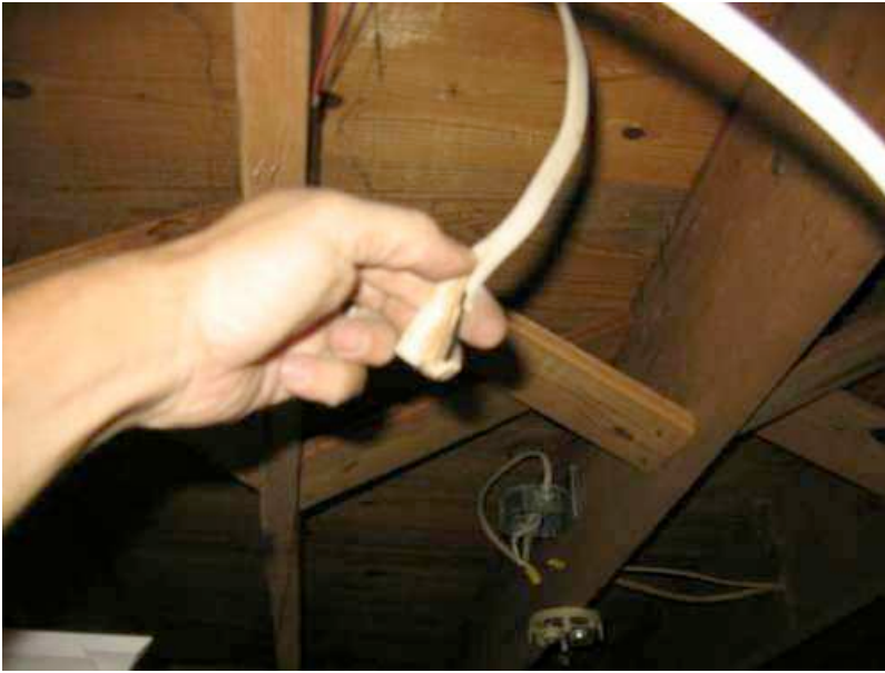
Disconnected electrical wire hanging from the basement ceiling. Deficient.