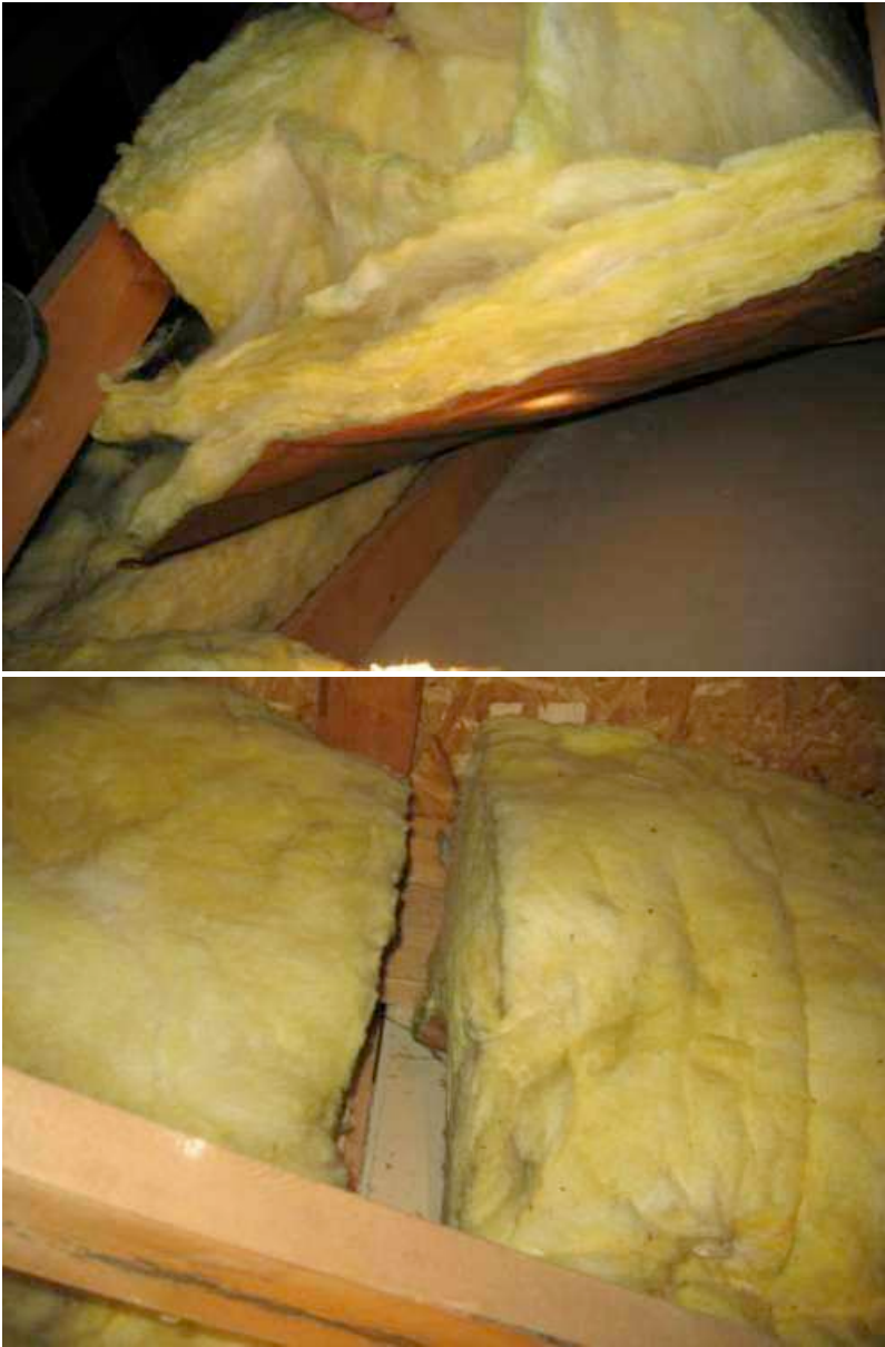
The approximate average depth of the fiberglass insulation is 8 inches (R-25).