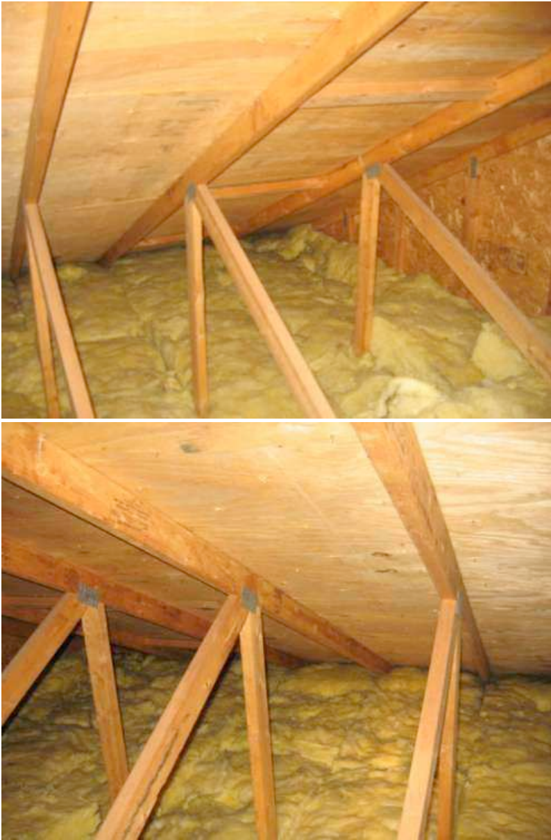
The attic space was inspected by entering it. The access was limited, because there was no flooring on which to stand or walk.