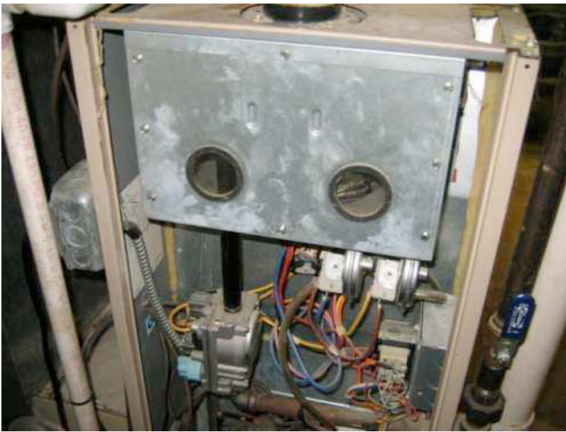
The type of heating system is a gas-fired, high-efficiency system.