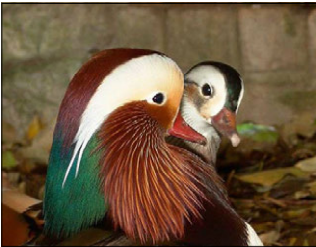
Ducks by Eldred Stamp Second, Attanyi Salon