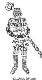
Knight in Handwriting