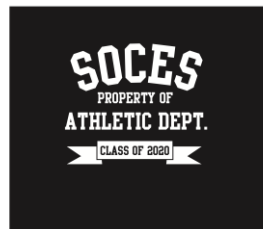
SOCS Athletic Dept