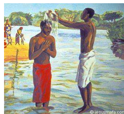
Baptism of Our Lord by Jesus Mafa,

Thinking about the readings we hear in church, reflecting on them, imagining them, sensing them, can help us deepen our daily prayer time. This week's Gospel is about Jesus' own baptism. It is not remote from us; it is close as breath.