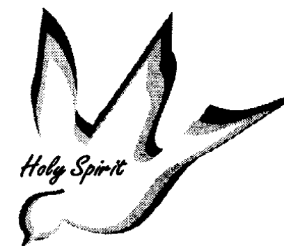
Ruach (Hebrew) and Pneuma (Greek) both translate spirit-wind-breath

Now find your space on the mountain top alone. Gaze at the evening sea. Wait for the One who sent you. Breathe. Be still. Know God.