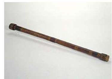
One of Galileo's telescopes

In 1609 the telescope was brand new technology! We have learned a lot in the past four centuries!