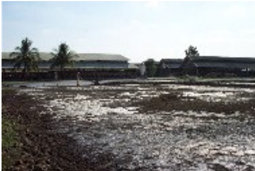
Figure 1 Lagoon, The Local Common Practice

PhilBIO proposes a novel animal waste management system to recover methane gas emissions as an alternative to current open lagoon systems. Wastewater treated in these lagoons is often at an ambient temperature of around 35°C, and under anaerobic conditions. The result of this is that biogas (mostly methane) is emitted continuously to the atmosphere, as can be seen in this typical farm lagoon system image.