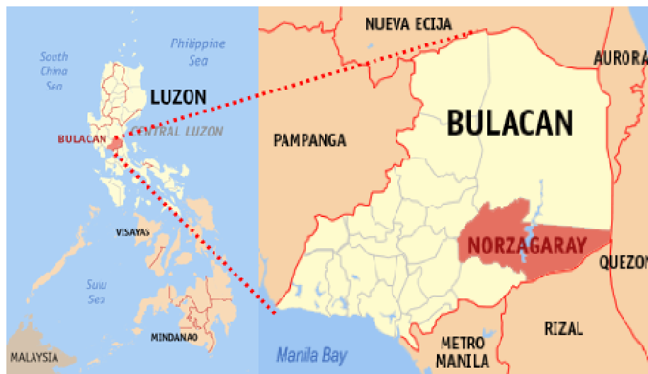
Figure 3 Location Maps 2

Norzagaray is a first class municipality located south east in the province of Bulacan. It has a population of 76,978 people in 15,912 households subdivided into 13 barangays.