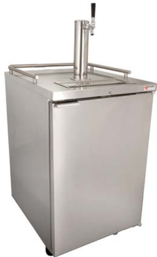
Stainless Steel MDD23S