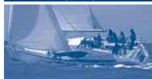
Sun Odyssey 45 DS