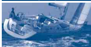
Sun Odyssey 42 DS