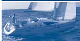
Sun Odyssey 39 DS