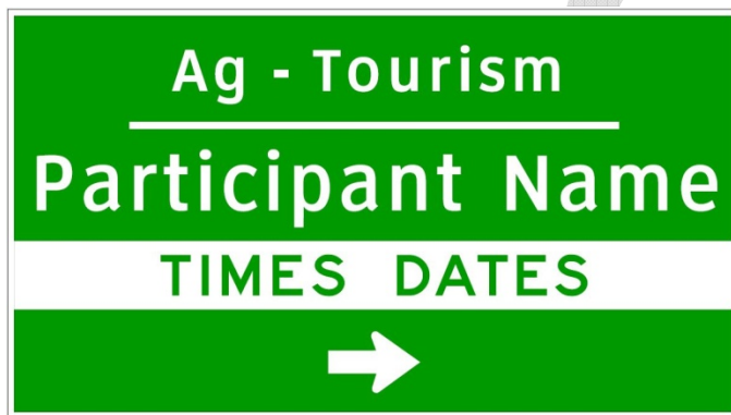
Figure 1 –Ag-Tourism Sign

MDA and the SHA have approved the Ag-Tourism highway sign design shown in Figure 1 below. The costs for new and replacement signs will be borne by the Ag-Tourism Facilities requesting and approved for the signs.