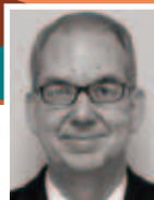
Snapshot Commissioner Olan Reeves