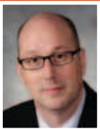
Panel 2 Edward Johnston