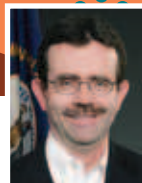
Panel 2 Commissioner James W. Gardner