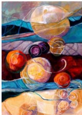
High Tide by Vi Gassman First Place