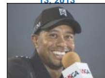
US Open At Merion Practice...