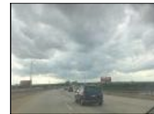
Storm Photos: June 13, 2013