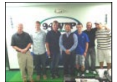
WIP Morning Show Father's Day...