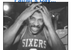
Julius Erving Through The...