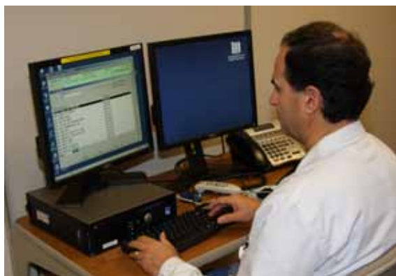
Licking Memorial Health Professionals physicians began using electronic medical records in 2001 and are now among the nation's leaders to use the technology.

performed, medications and treatments provided. This information can be used to improve the health of the patient, eliminate the need for repeat testing, and