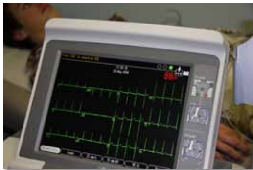
LMHS' pre-participation screenings will offer free physicals, EKGs and baseline concussion screenings to eligible students in May, June and July.

EKG tests will be offered free of charge to students in grades 7 through 12 who did not receive one in 2012. In addition, any student athlete who is identified as having high-risk symptoms, a family history of certain heart conditions, or suspicious examination findings, may receive a free EKG in 2013 even if one was administered in 2012. The painless EKG displays the heart's electrical impulses and can identify heart conditions that place the athlete at risk for sudden cardiac death even when there are no symptoms. A satisfactory EKG result for each athlete is required every two years for LMHS to give clearance for the student to participate in activities. The EKGs will be