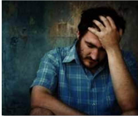
For information about drug and alcohol treatment at Shepherd Hill, call (800) 223-6410, or visit www.ShepherdHill.net .