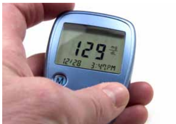
Diabetes education classes at Licking Memorial Hospital help patients gain better control of their blood sugar levels.

Diabetes Education at LMH Proven to Lower A1c Levels (continued on page 2)