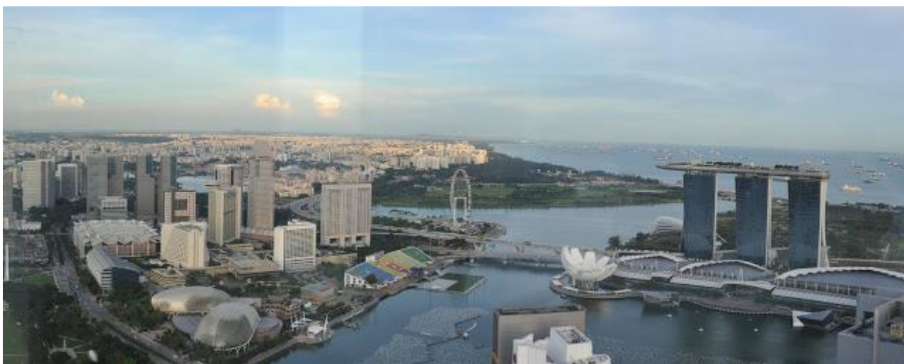
A view from Si Chuan Dou Hua restaurant

TOP of UOB Plaza, 80 Raffles Place, #60-01 UOB Plaza 1, Singapore 048624