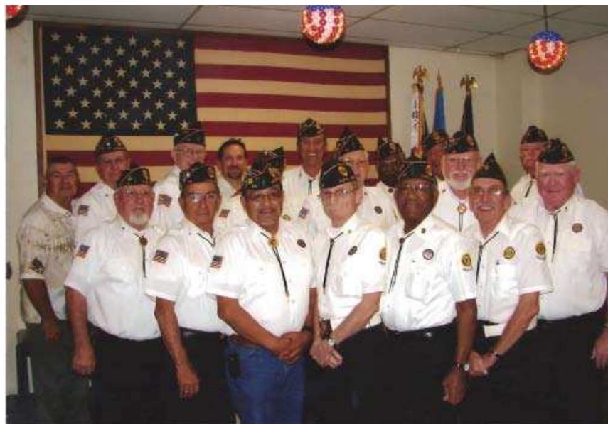
H.H. Donkersely Post #19 Ceremonial Team

The American Legion Post #19 Ceremonial Team met at American Legion Post #56 for its annual dinner on 22 March 2011. In all, 18 members were present along with their ladies. This dinner is held yearly and paid for by donations and contributions. The team is comprised of 26 Legion members (seven are from Post #56). Most are retired military and some are retired members from the civilian community plus members that are still employed.