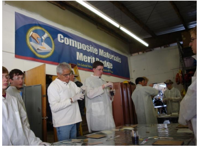
Scouts doing the Composite Materials Merit Badge