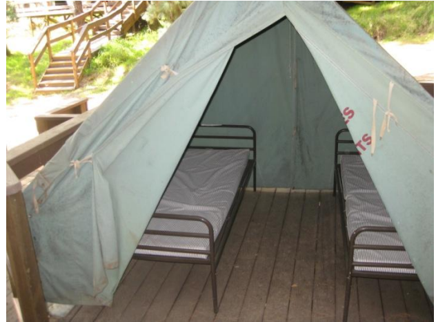
Tent – Sleeps two