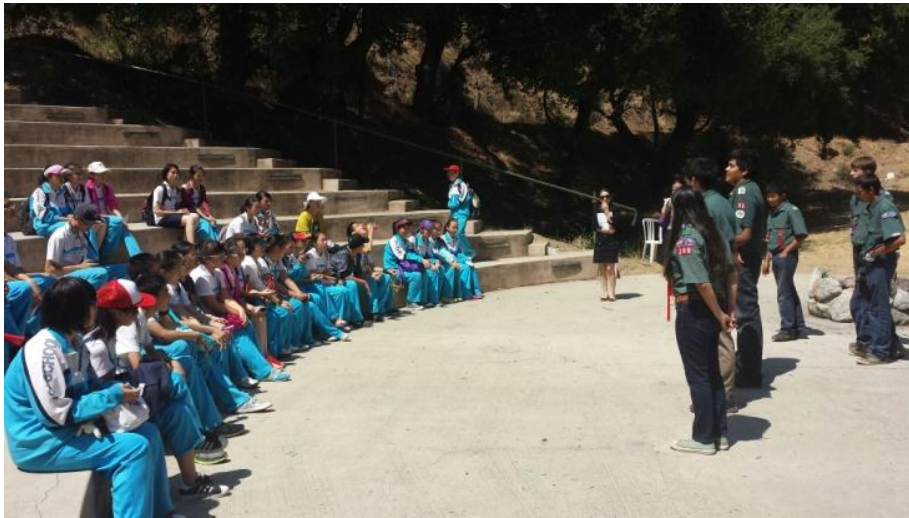
Trask Staff (in green shirts) doing skits and songs with International Students.