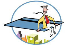
Rental Credit Check