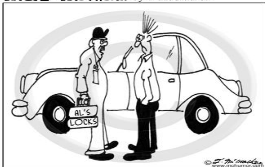
"Let me guess: you lost your car keys and tried to hot-wire it."