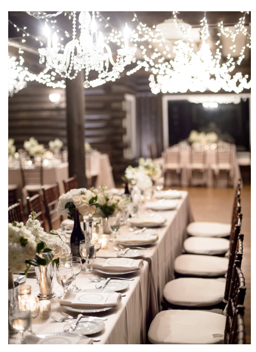
The Clubhouse all dressed up.