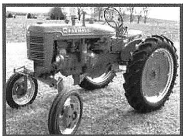
1953 Super AV#SAAV340