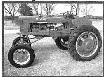
1947 HV #FBHV260114