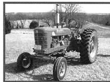
1954 Super MTA #812065

Johnson County Fairgrounds Gardner, Kansas