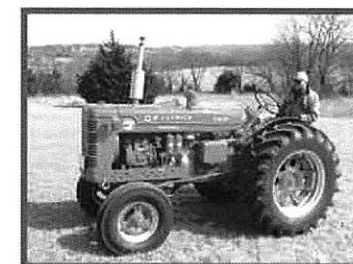
1953 Super WD-6 #6396J

Commission Rates: 8% on all IH tractors, Trucks & items displayed outside.