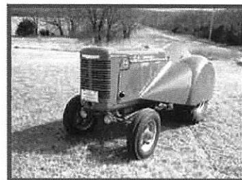
1946 McCormick O6