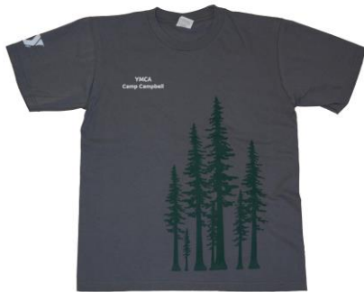
T-Shirt, $15 (front)

We have a great selection of items your child can take home to remember their experience at YMCA Camp Campbell. Please indicate below the item, quantity and size that you'd like for your child and/or family members and return along with payment to your child's classroom teacher by: ___/___/____. THANK YOU