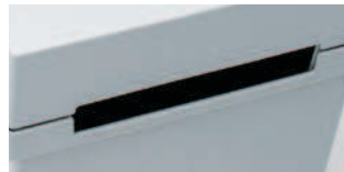
Recessed handles for lifting shredder unit from bin.