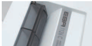
Safety flap in the feed opening keeps fingers away from the cutting shafts.

empty shred bin (all C models). Model 1126 S / 1126 C: attractive shred bin with 20 litre volume. Dimensions: H 428 x W 345 x D 213 mm. Model 1128 S / 1128 C: high-quality cabinet with slide-out shred bin. Large window in bin to show fill level. Dimensions: H 516 x W 345 x D 213 mm.