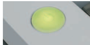
EASY-Touch control element for intuitive operation.