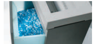
Slide-out, 20 litre shred bin with large window to show fill level.