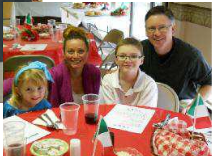
Below: Waiting for the delicious Italian dinner