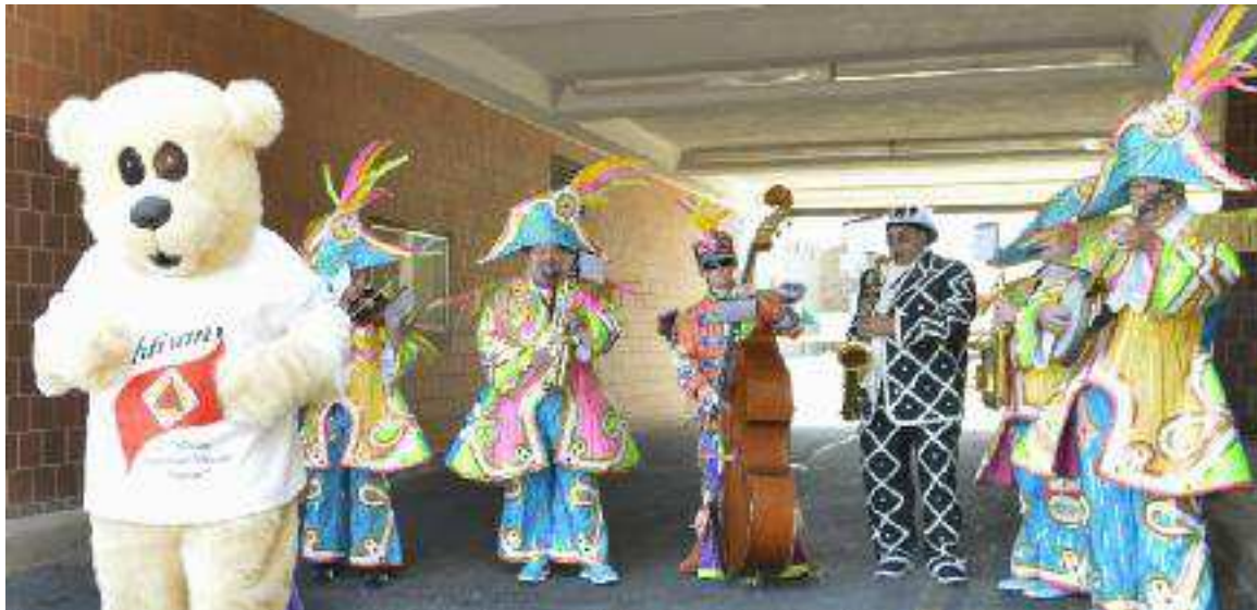
Above: Artisan mascot leading the Mummers