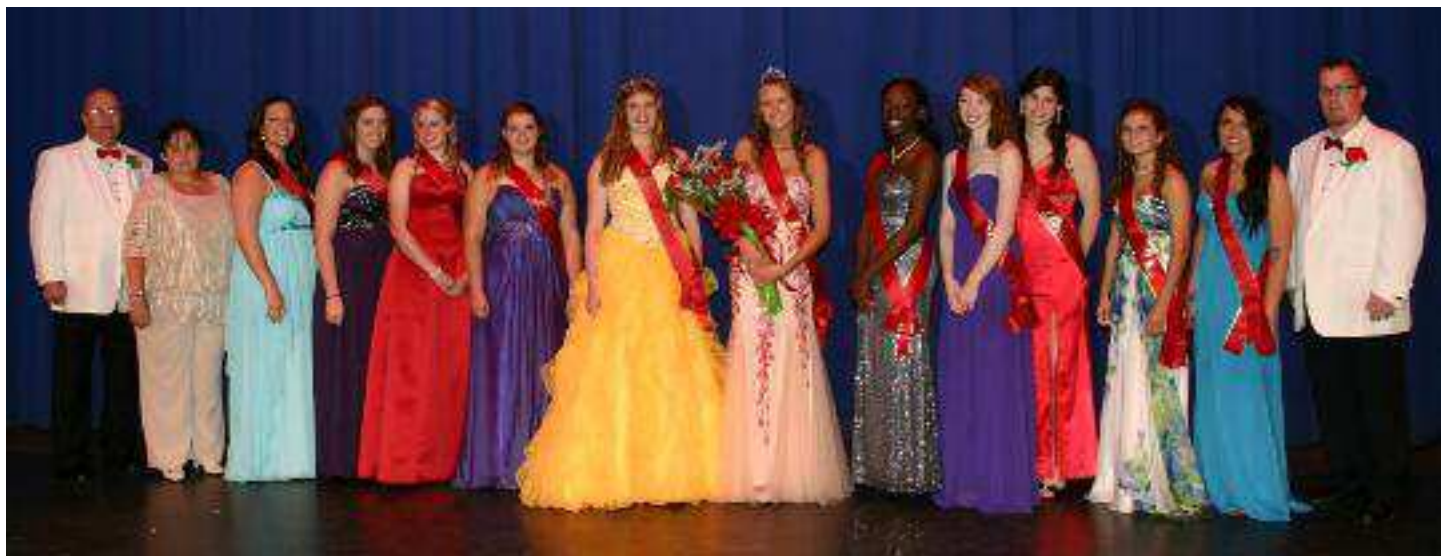
Most Excellent Officers and Miss Artisan Contestants