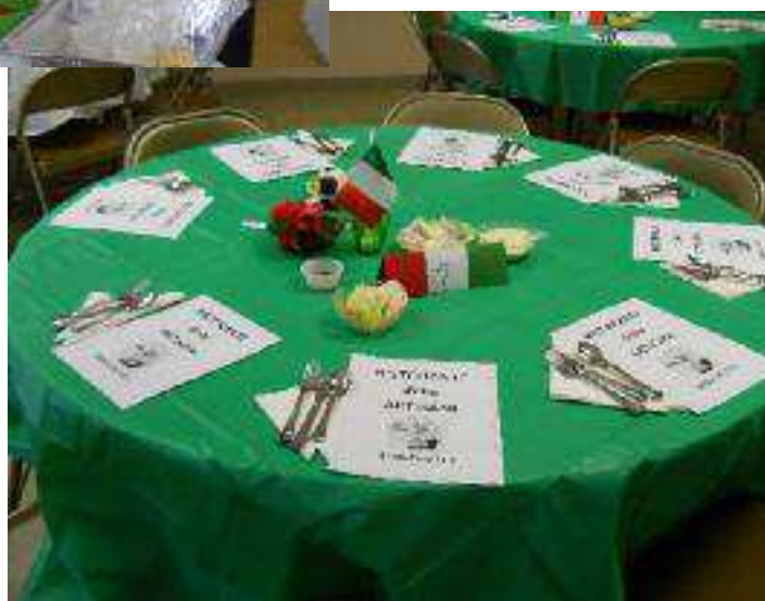
Above: Beautifully set tables ready for hungry Artisans