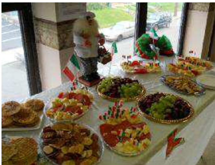
Delicious appetizers before dinner