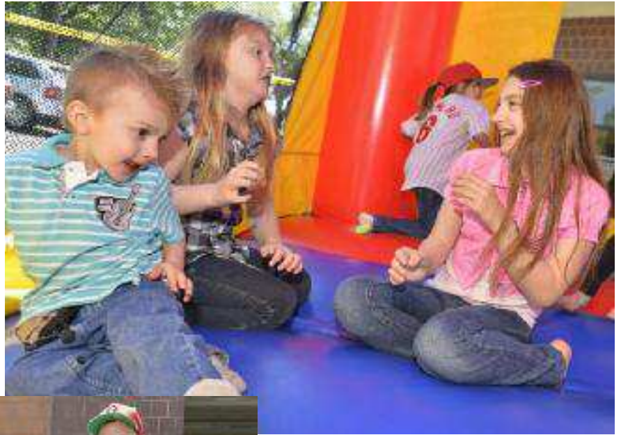
Above: Junior Artisans enjoying the moon bounce