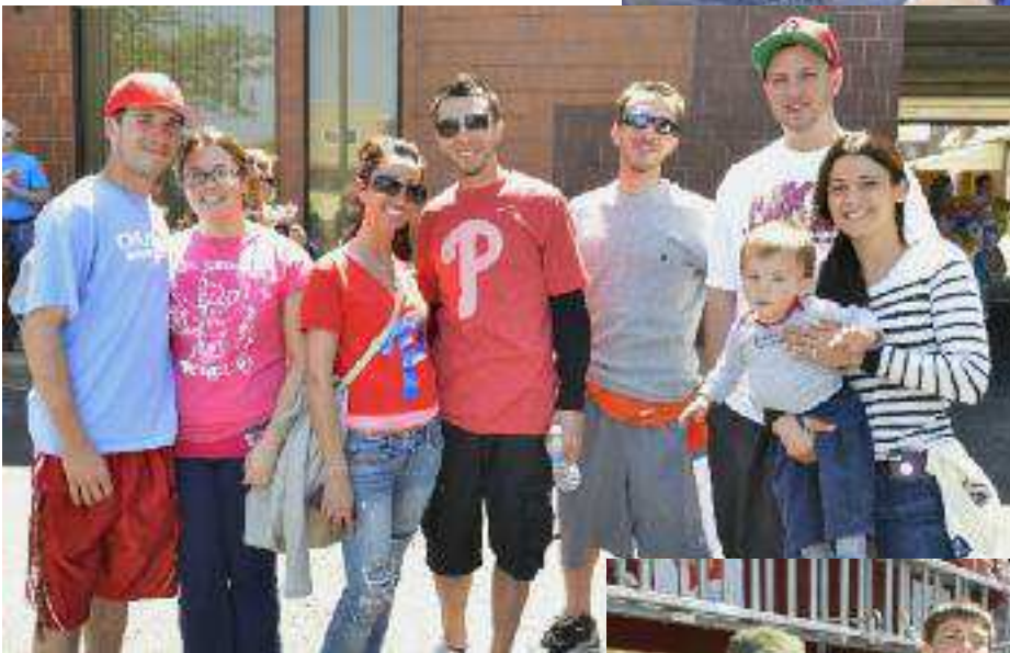
Above: Enjoying friends and family with the Artisans