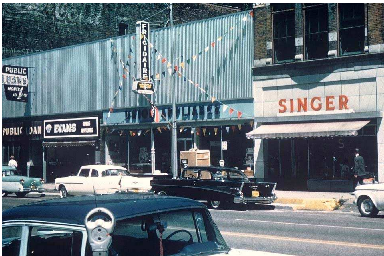
Middle building and east building (512) in 1961 (Downtown Partners)