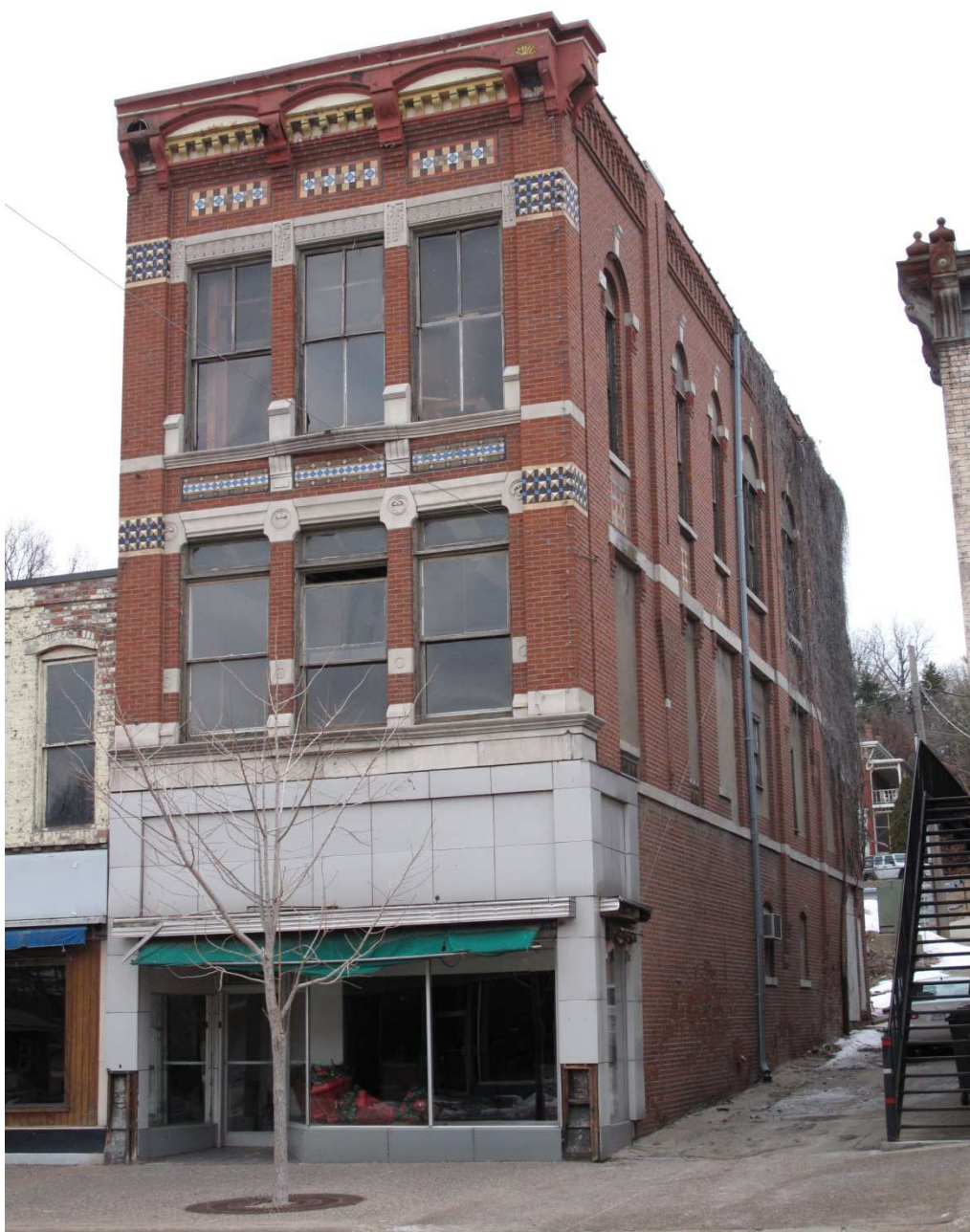
Photograph 29-01114-001 – South and east elevations, looking northwest.