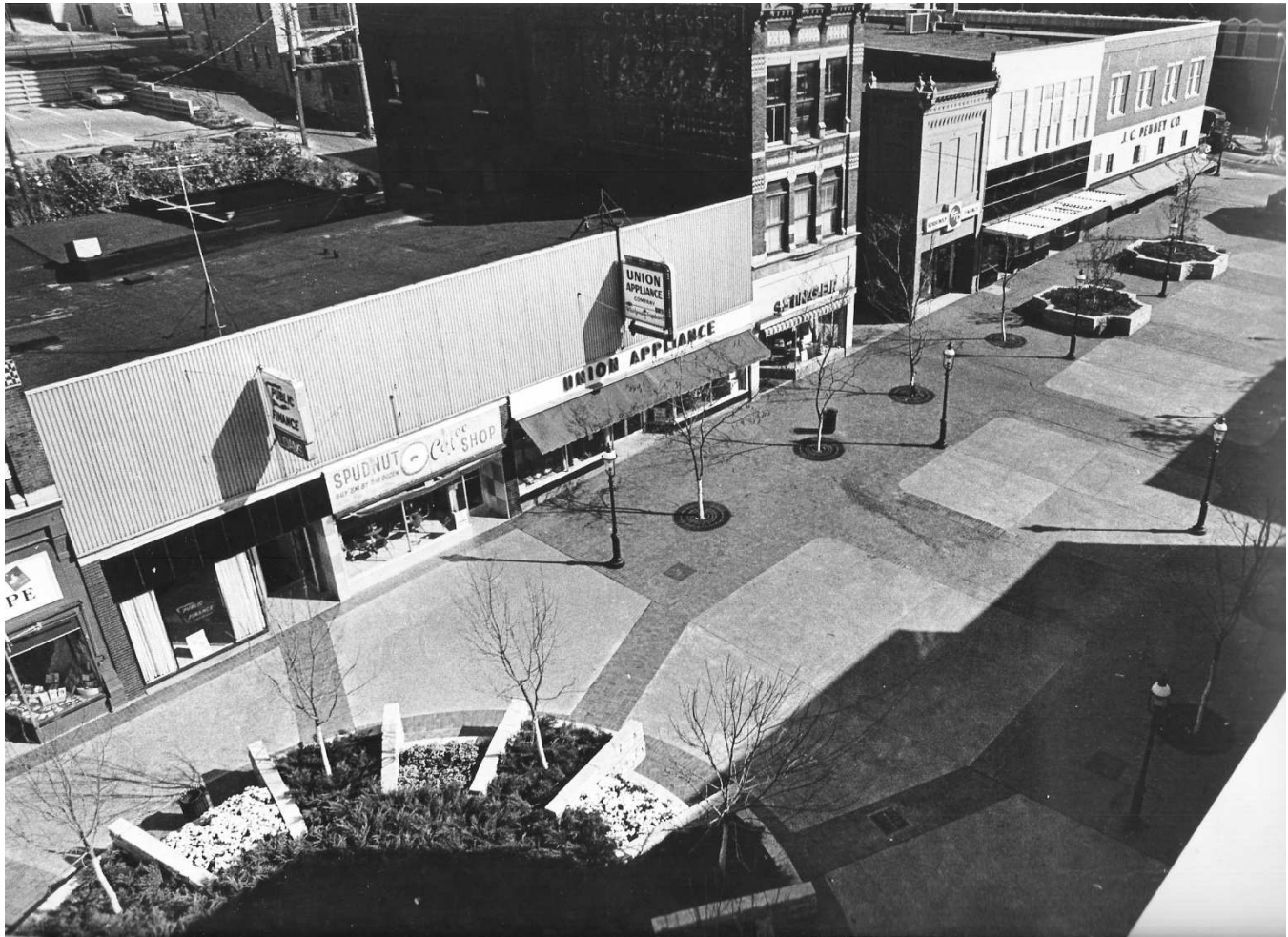
North side of 500 block of Jefferson in late 1970s (Downtown Partners)