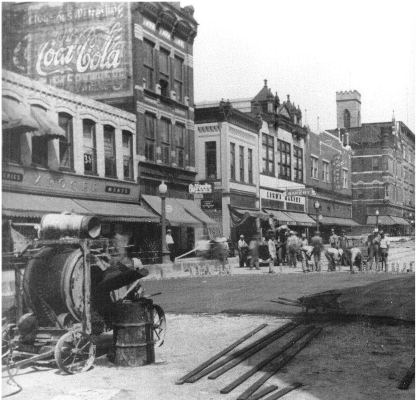
514-516 512 510 508-506 504-500 Jefferson