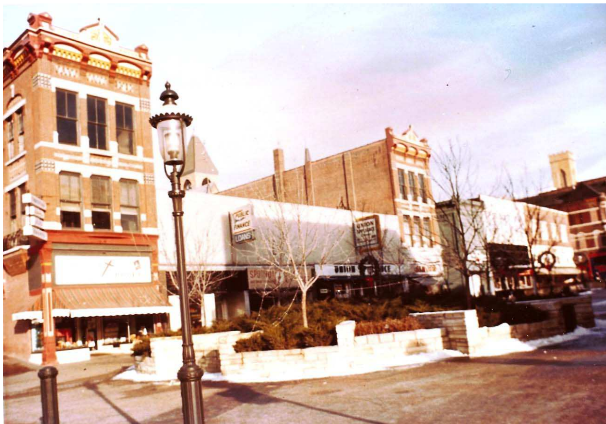
West half of north side of 500 block of Jefferson in 1977