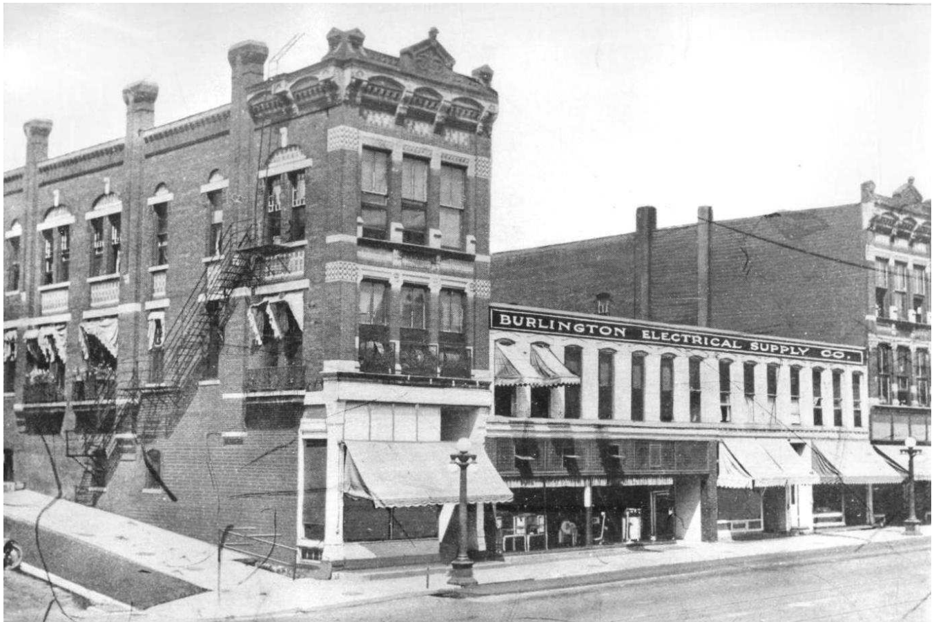
West half of north side of 500 block of Jefferson in 1920s (Downtown Partners)