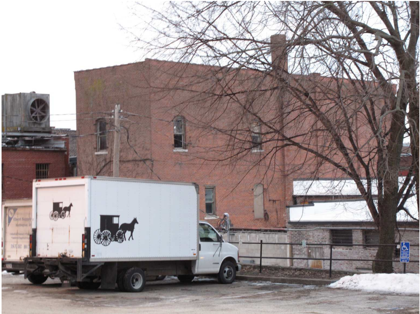
Photograph 29-01114-003 – North and west elevations, looking southeast (, January 14, 2014).