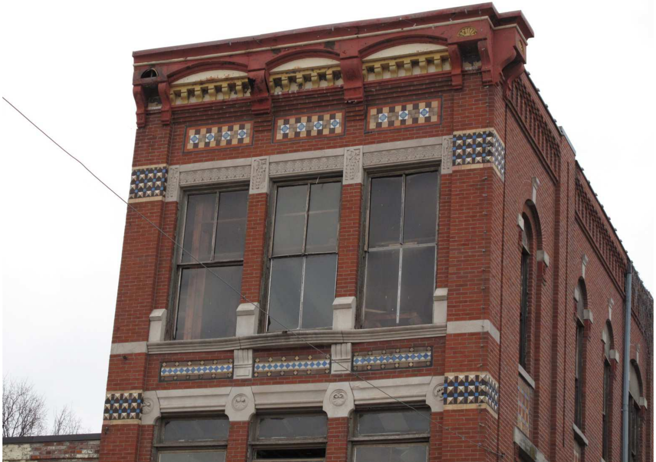
Photograph 29-01114-002 – Detail of upper stories, looking northwest.