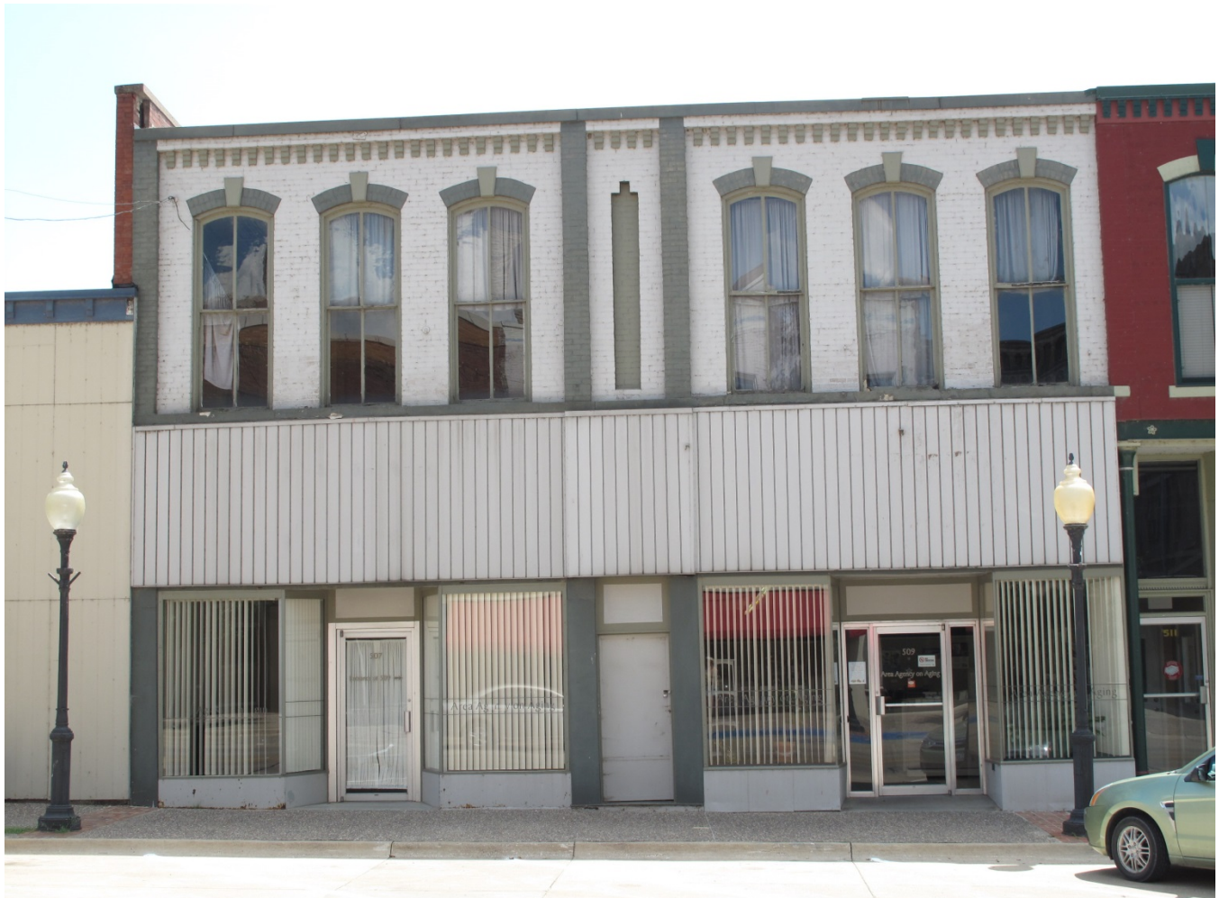
Photograph 29-01111-001 – North elevation of 507-509 Jefferson section, looking south.