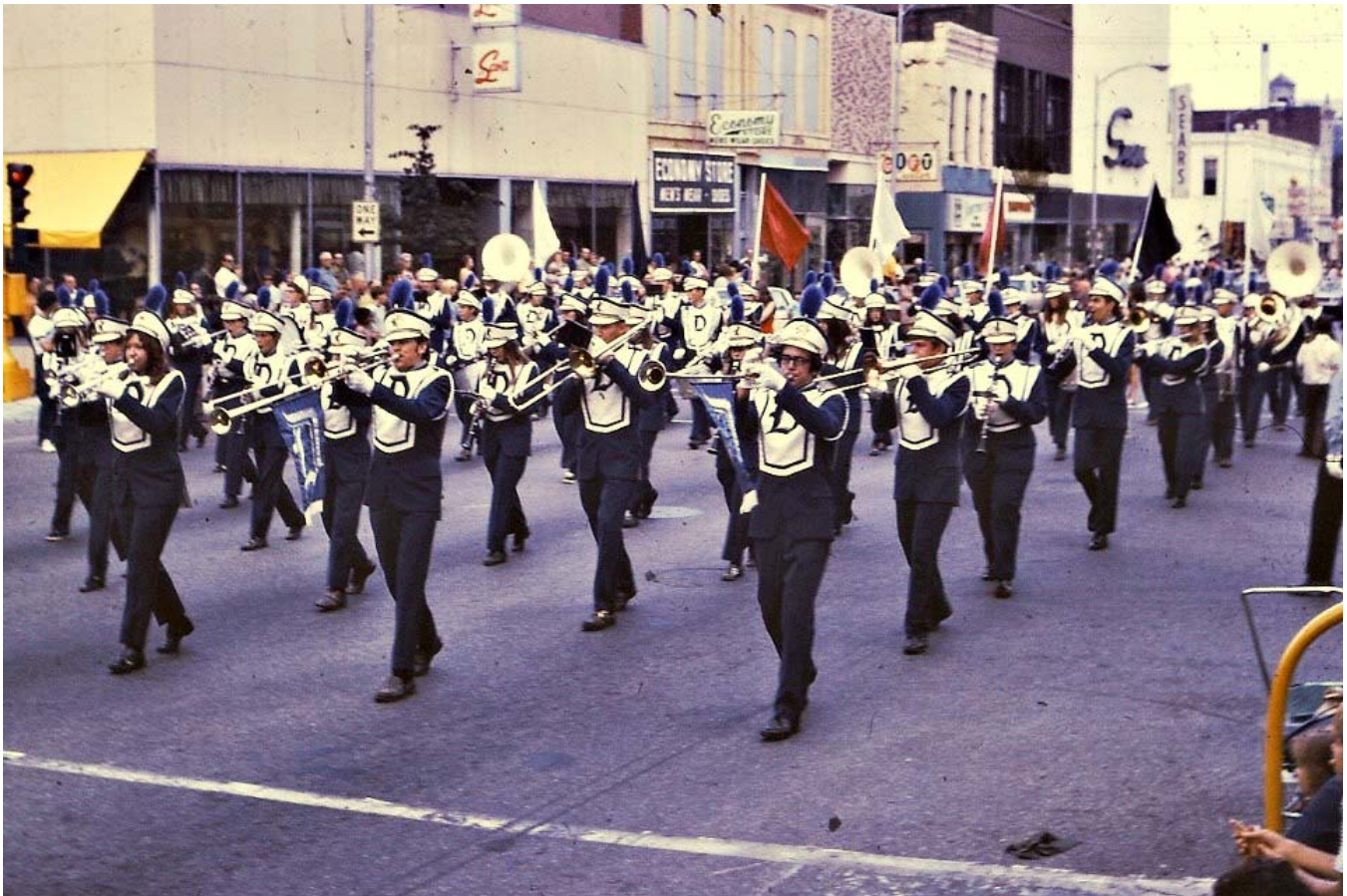
South side of 500 block of Jefferson in 1971