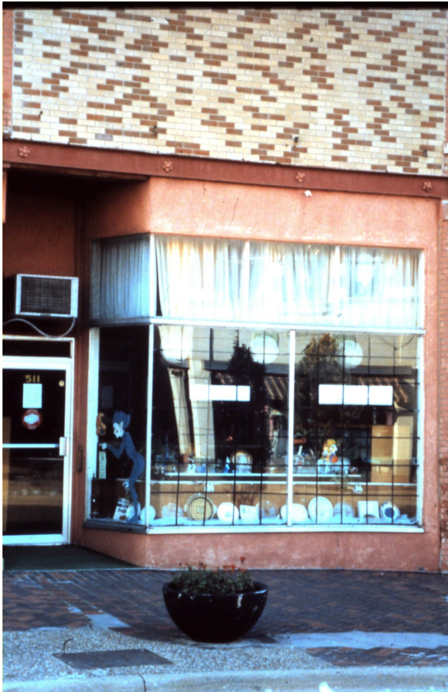
Clad portion at 511 Jefferson in 1990s (Downtown Partners)