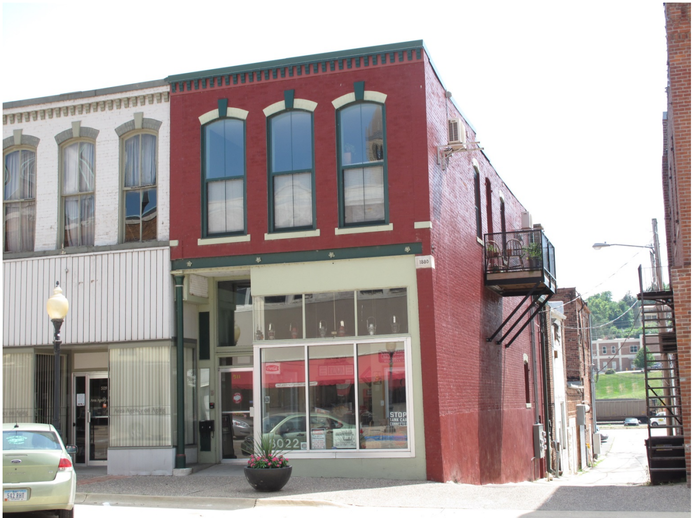
Photograph 29-01113-001 – North elevation of 511 Jefferson section, looking south.