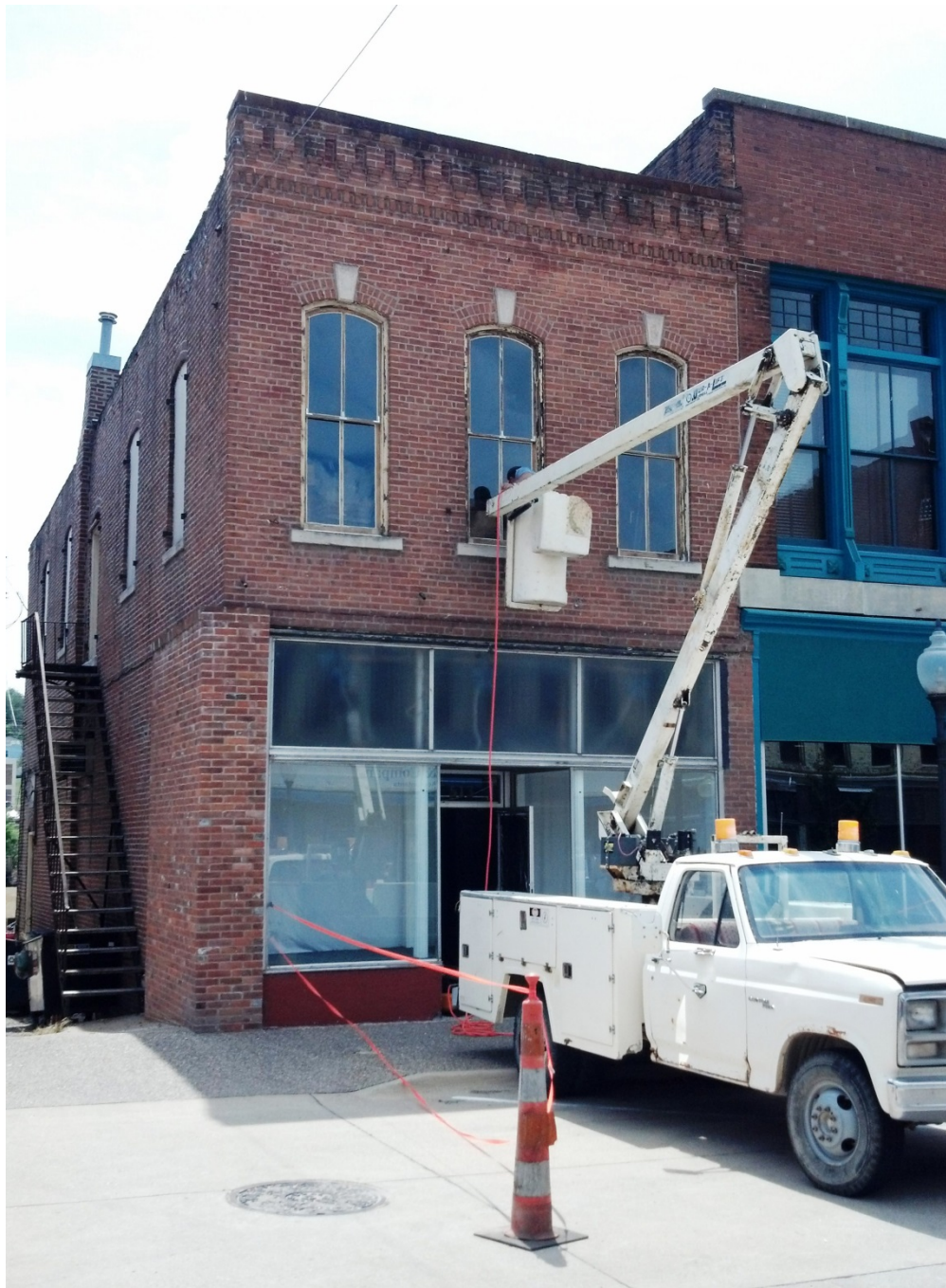
Windows being uncovered (Downtown Partners, July 26, 2013)