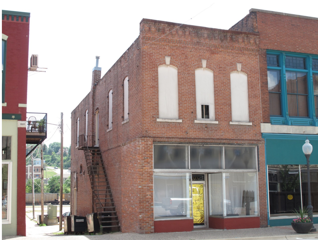
North elevation before boards removed, looking southwest (McCarley, July 17, 2013).