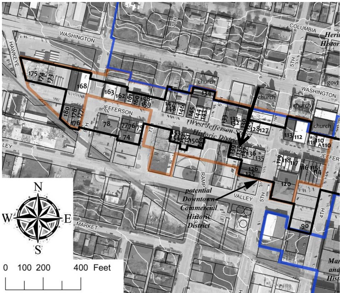
Base aerial photography by Aerial Services Inc for Des Moines County GIS Commission, March 2010.