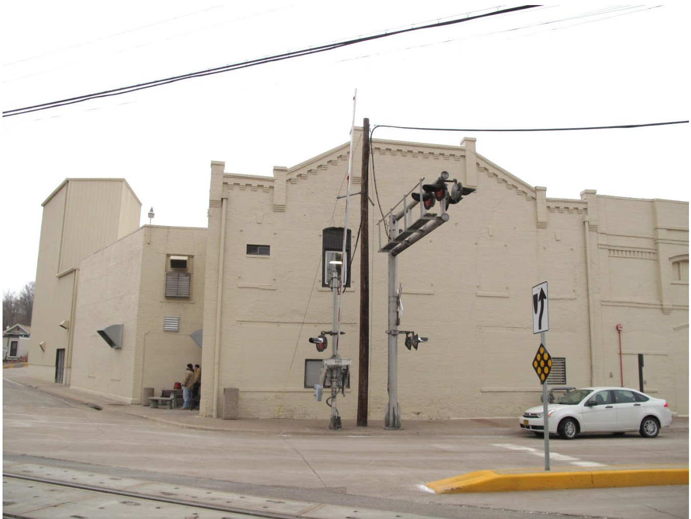
Photograph 29-03094-001 – South elevation, looking north.