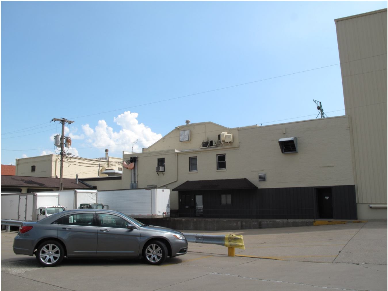
Photograph 29-03094-002 – North elevation, looking south (, July 17, 2013).