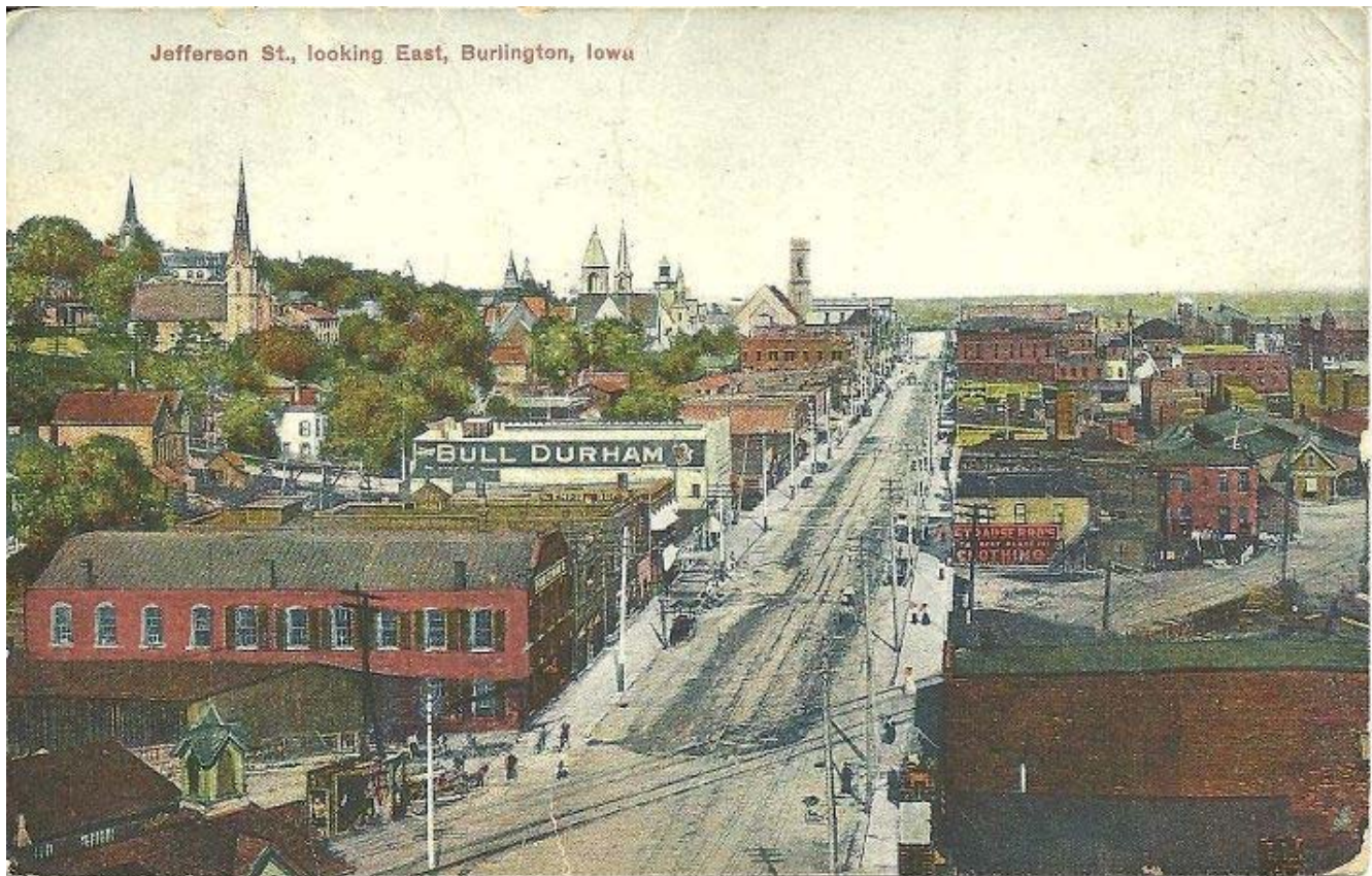
Building at left in 1910s, looking east on Jefferson from 800 block