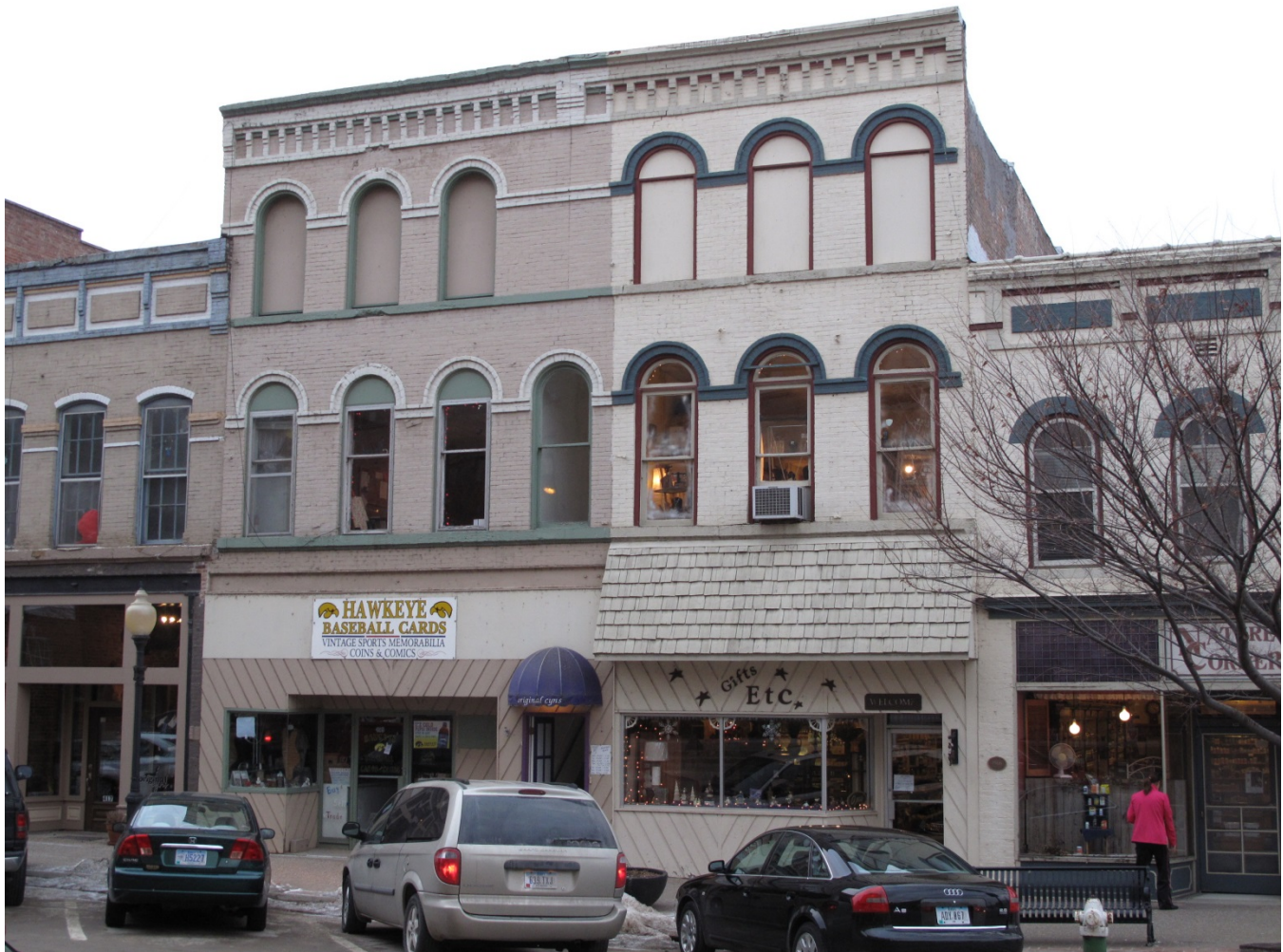
Photograph 29-01105-001 – North elevation, looking south.