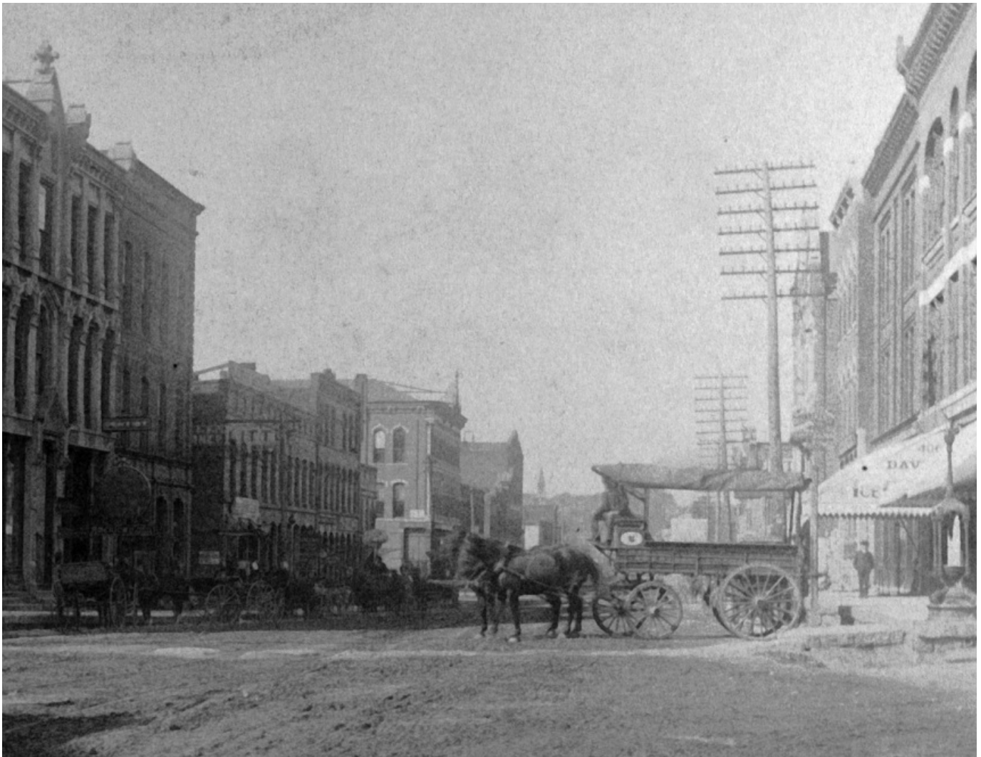
cropped/enlarged view of 400 block of Jefferson in 1890s, looking west (building at left on end) (Downtown Partners)