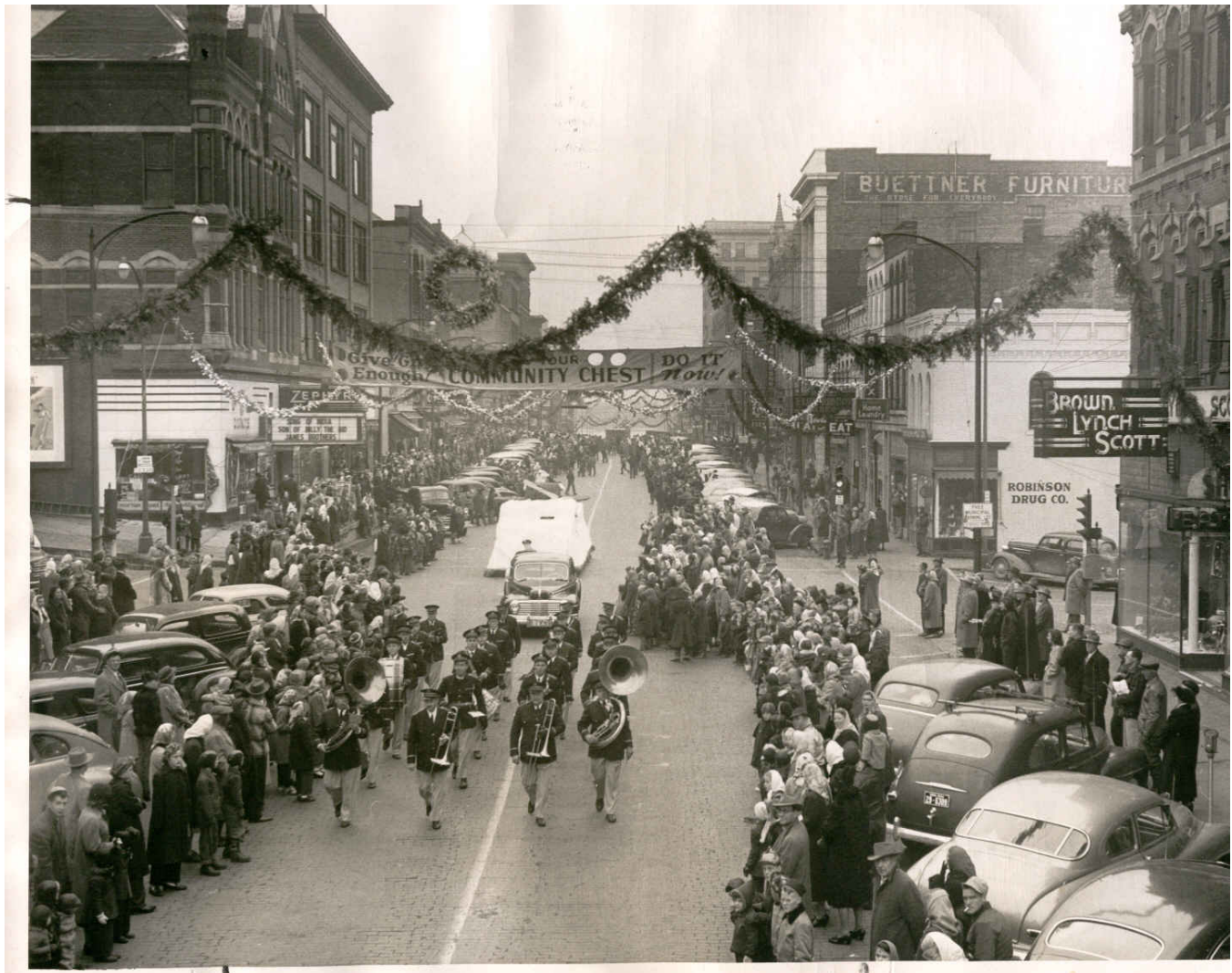
400 block of Jefferson, looking east, around 1949 (building at right)