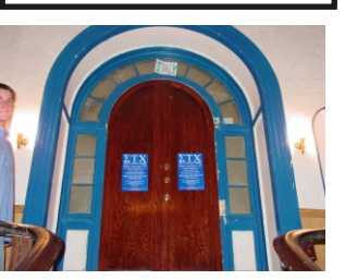
New doors for the Fish bowl