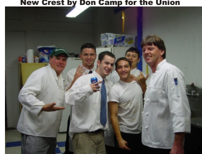
The chef and kitchen "crew" alumni weekend 2004