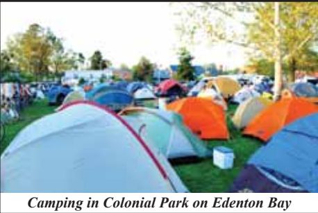
Camping in Colonial Park on Edenton Bay

Downtown Edenton and the waterfront area will be the center of activities during the weekend. Rider's will be able to pitch their tent just yards from the Albemarle Sound and the