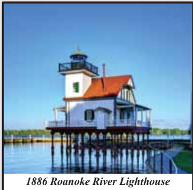
1886 Roanoke River Lighthouse

Food Options Edenton is home to a number of great local restaurants, all located within walking distance to all campsites during the weekend. Make reservations for fine dining or drop into one of the several restaurants that offer a casual setting with selections for everyone. All of this is within walking distance from the CNC campsite areas. Park your car and enjoy the weekend!