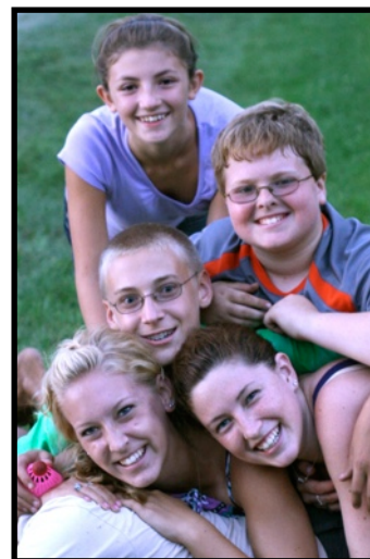
A heap of Bull cousins, Bull Picnic 2010

Please send your e-mail address along with your name and postal address to Judy Wood via e-mail at bullfamilygenealogist@verizon.net , by U.S. mail at 5505 Frost Lane, Flower Mound, TX 75028 or by phone at (972)539-4215. We need to keep the herd informed.