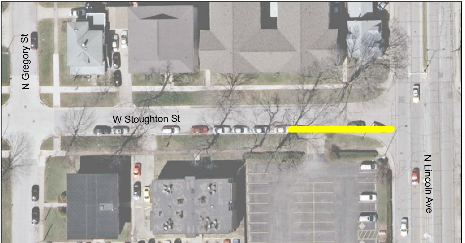
Proposed No Parking- Stoughton Street From 33 feet west of Lincoln Av centerline to 121 feet west of Lincoln Av centerline - south side of street.