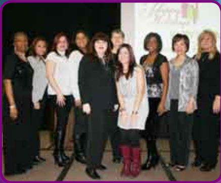
The College of Dentistry Choir entertained by singing holiday tunes.