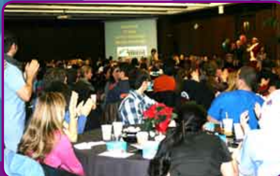
The crowd cheered as longtime employees' years of service were acknowledged.