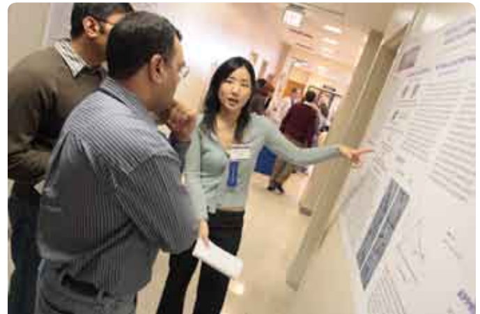
Students and fellows will present posters highlighting their current research at Clinic and Research Day.

Get the latest dental knowledge at the 26th annual Clinic and Research Day, set for Thursday, March 7, at the College, which will take on the appearance of a national dental meeting all day.