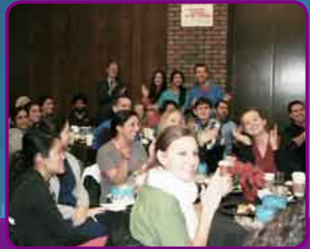
Smiles were the order of the day at the Holiday Party.