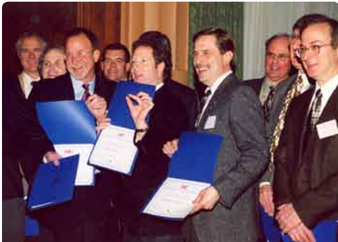
Smiles will abound for alumni at Reunion 2013.

UIC College of Dentistry and Loyola University Chicago alumni will gather at the 2013 UIC College of Dentistry Centennial Reunion at Carlisle Banquets, 435 E. Butterfield Road in Lombard, IL, Friday, April 26. The Carlisle was the site of successful and popular Reunions in 2010 and 2011.