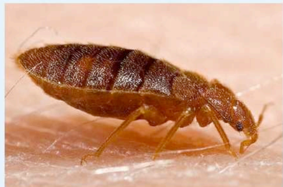
Bed bug images provided by U.S. Centers for Disease Control and Prevention