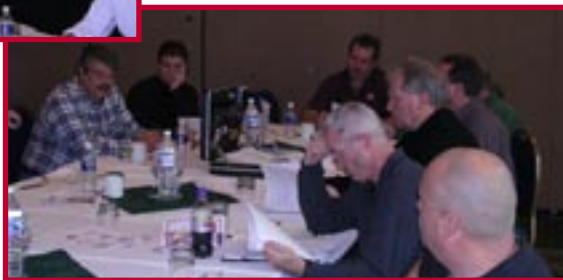
Board Members trying to decide what the best name is for this Newsletter.