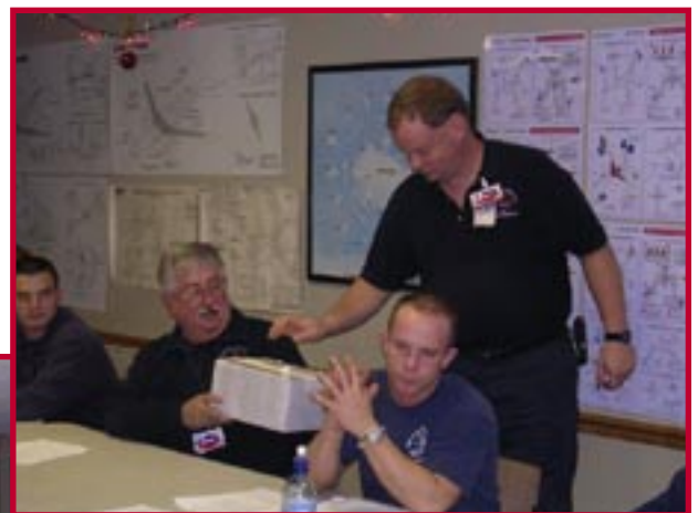
Brothers of newly organized Indianapolis Airport Firefighters Local 4294 vote on their 1st contract. The contract passed 19 yes 2 no. Congratulations Local 4294!