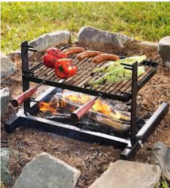
7: Small campfire grill on dirt – OK? _____