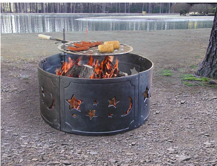
8: Fire Ring with cooking Grill – OK? _____