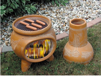
4: Small clay Chimnea with BBQ grill – OK? _____