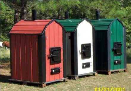
6: Outdoor wood burning fireplaces – OK? _____