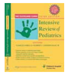
Full Symposium registration fee includes a copy of the textbook based on this symposium