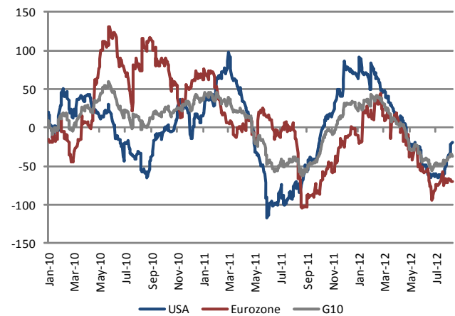
Economic Surprise indicators (as of 13 August 2012)

The JPMorgan Global Output PMI rose slightly from June to July thanks to an improvement in services. Nevertheless, at 51.7, the composite PMI is one of the weakest in three years. Moreover, new orders and employment components are boding ill for the coming months. The eurozone is seriously lagging as activity contracted for the sixth month in a row, while the US manufacturing Ism was below 50 for the second consecutive month (49.8 in July). Remember that the 50 threshold is the dividing line between expansion and contraction in industry and that, according to the Institute for Supply Management, no recession occurs throughout the economy until the ISM manufacturing index is below 42.6. The economic momentum in the US has stopped deteriorating since mid-July as illustrated by the economic surprises” index, which expresses the gap between market economists’ expectations and the data actually published. It is still in negative territory but improved from -60 to -20.