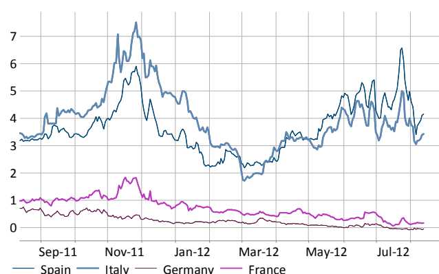
2-year bond yields (in %)

For our analysis on the ECB's Governing Council meeting on 2 August, please see our Flash note No big step from the ECB . Since then, several official comments were made in order to dampen expectations about rapid bond purchases. No surprise that the more severe comments are from Germany with former ECB chief economist Otmar Issing stating that ECB bond buying is wrong. Benoît Coeuré (member of the ECB's executive board) stressed the irreversibility of the euro but claimed that the ECB should ensure that central bank loans help small and medium-sized enterprises and consumers. Mario Draghi made it clear and simple: the Spanish government now has the floor. If Mr. Rajoy does not officially seek EFSF's aid (and accept conditionality), nothing will happen. Time for action has not come yet in the eurozone but it is noteworthy that, until then, the magic "whatever it takes" Mario Draghi's formula seems to be efficient on peripheral rates (see chart) despite the lack of details.