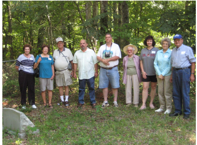
2009 Reunion Attendees at Old Whatley Cemetery