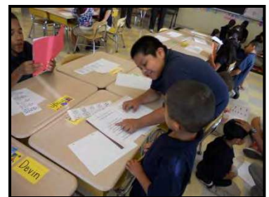
Fifth grade students read to students in Pre-k.