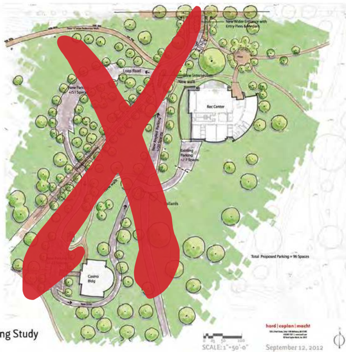
Patterson Park Parking Study Baltimore, Maryland