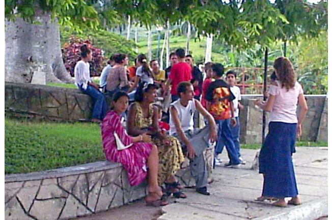
Students on the Los Pinos Nuevos Seminary Campus

We have many, many needs, but we thank God that in His mercy He shows his goodness to us each day. He is watching over us.