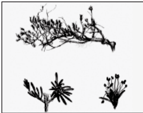
"Broom Crowberry, detail of watercolor by Robin A. Jess. Portion of plant above, inflorescences below: female (left) and male (right).

The Plains (a.k.a Dwarf or Pygmy Forests) consist of a vegetation community type found nowhere else on the planet. It's an odd name for a hilly area. Nineteenth century accounts, though, indicate the trees were no more than about knee-high, providing vistas to the horizon.