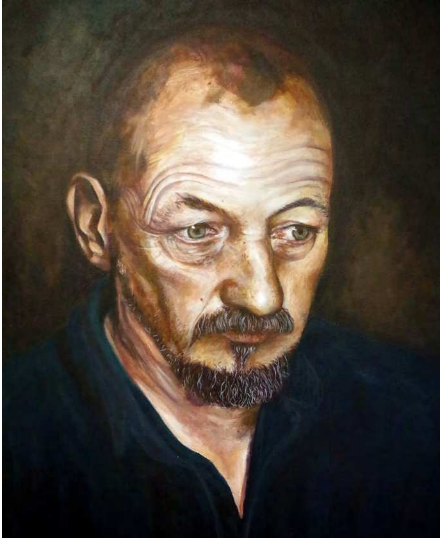
A Level Art work by Tanith Gould